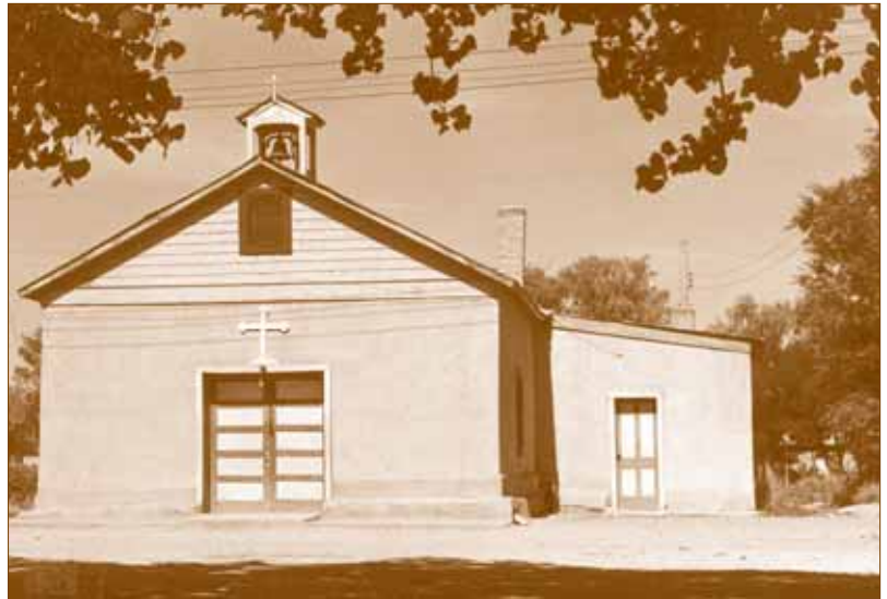
Capilla de San Jose, 1949, # 80.185.731, no other info available.

The original community reached south of I-40; the freeway was built almost through its center. In the process, houses were demolished, farm lands torn up and the neighborhood cut in two.