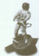
MAN IN SPACE - 2