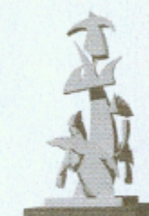
THE RIVER'S EDGE - 21

The space capsule was originally used for recovery training during the joint United States-Soviet Union Apollo-Soyuz missions. Donated and sealed in 1976, the space capsule became a time capsule holding items such as newspapers, photos, letters, a pacemaker, skateboard, and Grand Rapids made furniture. It will be opened during America's tricentennial on July 4, 2076.