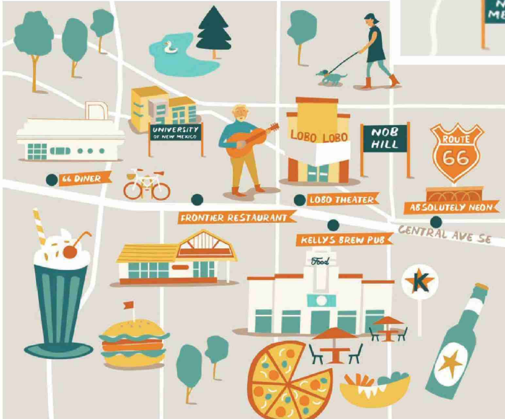
MAP ILLUSTRATION: MELANIE CHADWICK

IN 1937, ROUTE 66, WHICH stretched from Illinois to California, became the first paved road to cross New Mexico. It helped put the state's most populous city, Albuquerque, on the map, and became fixed in the American psyche—its glowing signs and open-road romanticism drew cross-country travelers like moths to a neon flame.