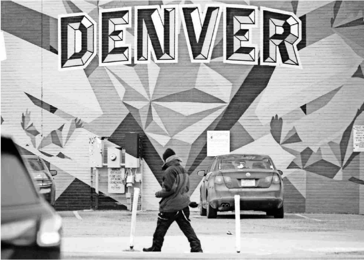
Interested in exploring street art? You can take a 5-mile graffiti tour in Denver.