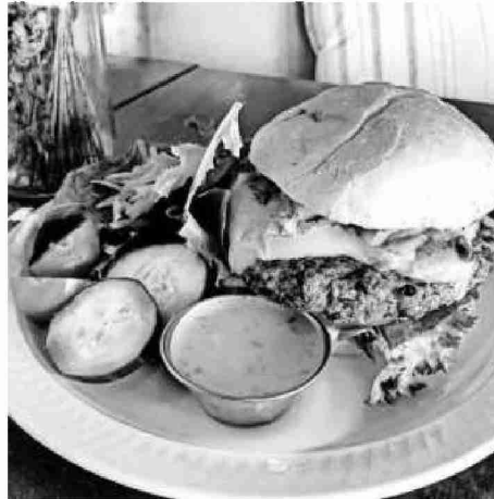
No trip to New Mexico is complete without a green chile cheeseburger, as long as you've got the stomach – or antacids – for it.