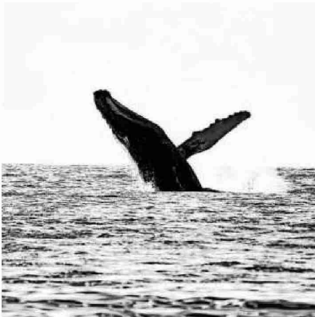
Play marine biologist on a road trip through Maui where whales are the main attraction from mid-November to March.