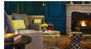
AUTOGRAPH COLLECTION OF OLD TOWN

Bite into a booming culinary scene praised by Food & Wine , Bon Appetit and The New York Times . Minutes from Washington, DC, our culinary oasis has served US presidents and Washington elite, as well as couples and families seeking a dining experience away from the norm. The city is known for its chef-driven and independently owned eateries,