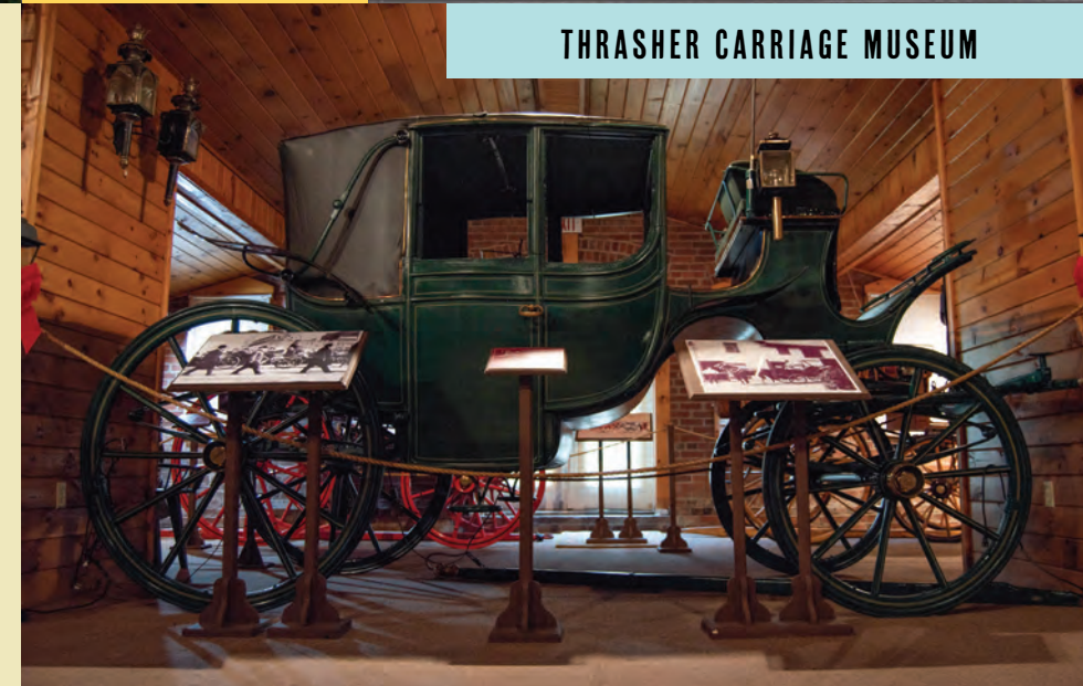
THRASHER CARRIAGE MUSEUM