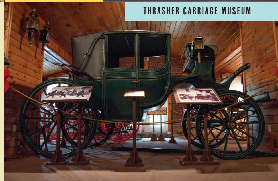
THRASHER CARRIAGE MUSEUM

FOR MORE INFORMATION ON TRAVEL PLANS AND EXPERIENCES IN HISTORIC FROSTBURG, VISIT