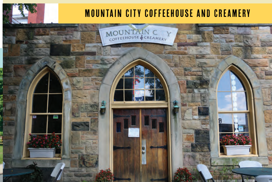
MOUNTAIN CITY COFFEEHOUSE AND CREAMERY