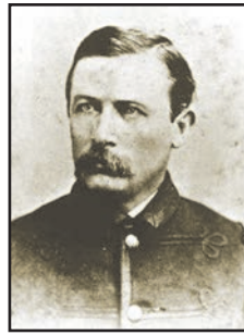
Col. Ranald S. Mackenzie

The decisive battle of the Red River War, 1874-1875, was the final campaign against the Southern Plains Indians.