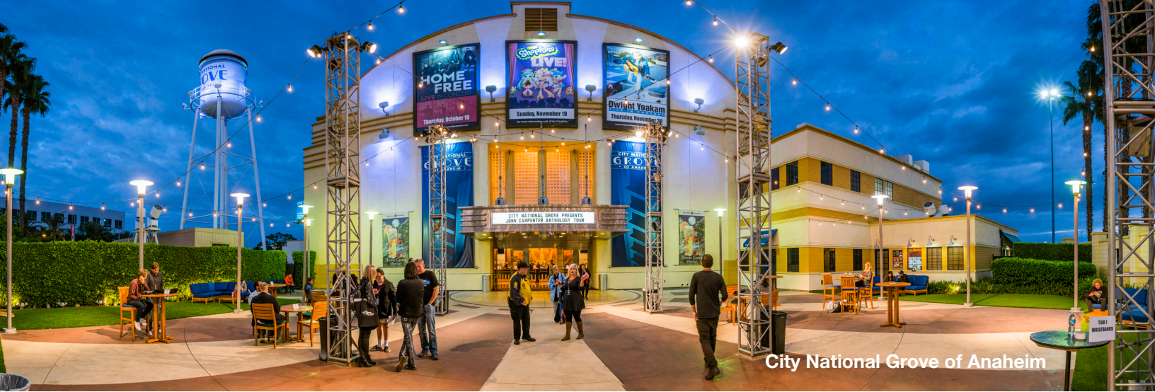
City National Grove of Anaheim