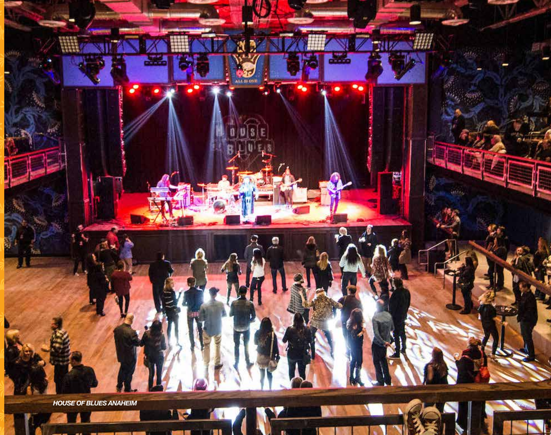
CITY NATIONAL GROVE OF ANAHEIM

World-class musicians, celebrated comedians and entertainers perform at this venue that also often hosts large private and corporate receptions, dinners and roaming networking events. Each room has a distinctive style and ambiance, among them a vintage industrial lounge, a private outdoor Palm Terrace and an art deco lobby perfect for cocktails.