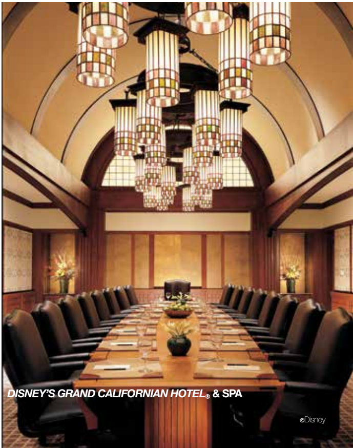
DISNEY'S GRAND CALIFORNIAN HOTEL® & SPA