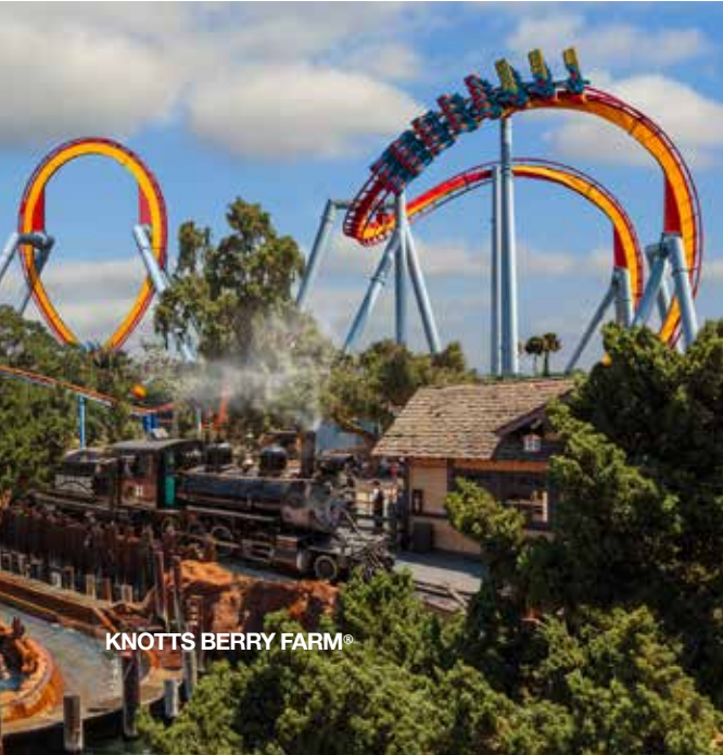
KNOTT'S BERRY FARM®

Orange | 3 miles from the ACC Buyout Capacity: 1,200 This venue offers a cutting-edge combination of modern bowling, innovative dining, lounging and multimedia art. It features a 75-seat restaurant with an inventive menu from Along Came Mary Productions catering. There's also a private room with six lanes, a projection screen and lounge for VIP events.