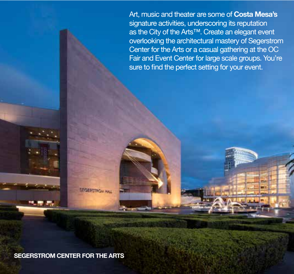
SEGERSTROM CENTER FOR THE ARTS

Easily accessible and adjacent to Anaheim, Garden Grove is an up-and-coming, value-packed option for visitors and the perfect spot for groups looking to access multiple areas for business and fun. Garden Grove also has a rich history that serves as a cultural hub for amazing and authentic Vietnamese cuisine.