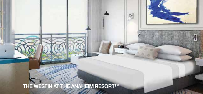
THE WESTIN AT THE ANAHEIM RESORT™