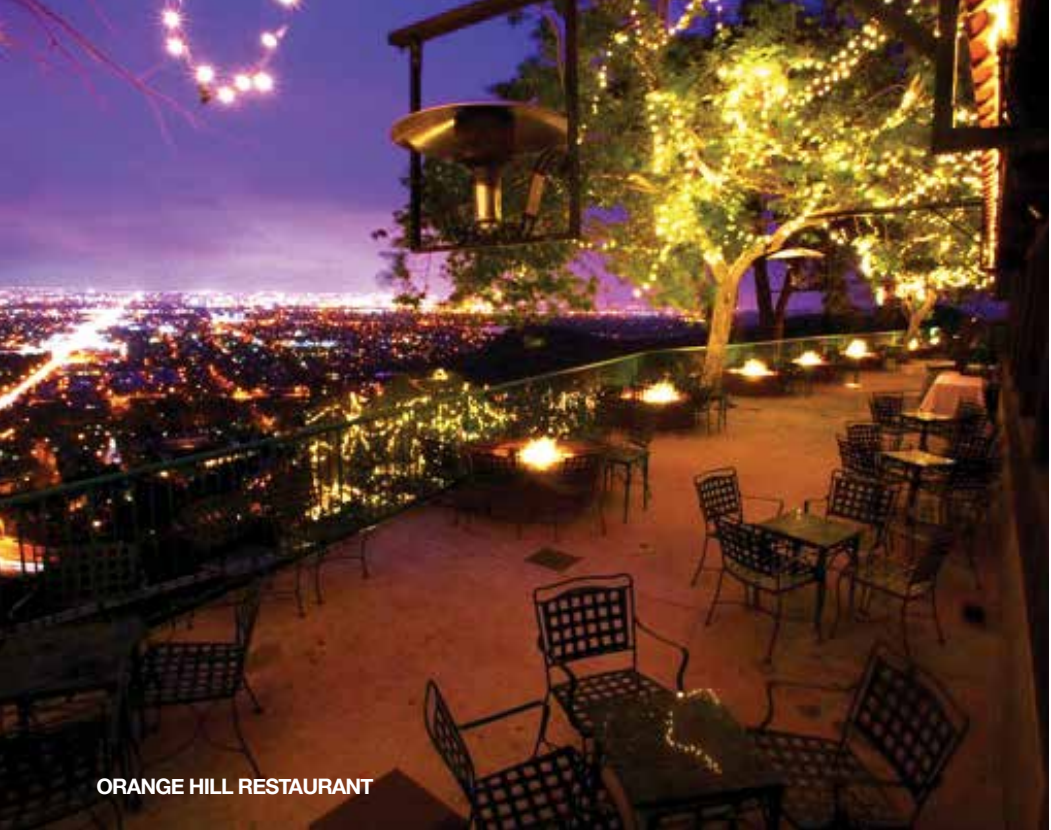
ORANGE HILL RESTAURANT