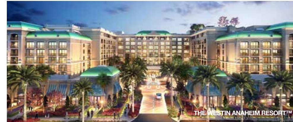
THE WESTIN ANAHEIM RESORT™

Hampton Inn & Suites Anaheim Resort and Convention Center located at 100 W. Katella Ave is set to open in Spring 2019 with 178-rooms, limited-service and will feature a second-level pool deck, breakfast room, meeting room and fitness room.