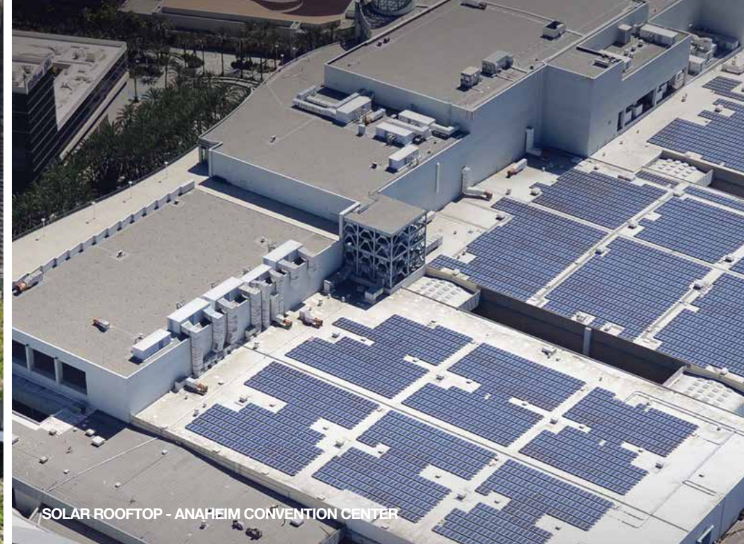
SOLAR ROOFTOP - ANAHEIM CONVENTION CENTER