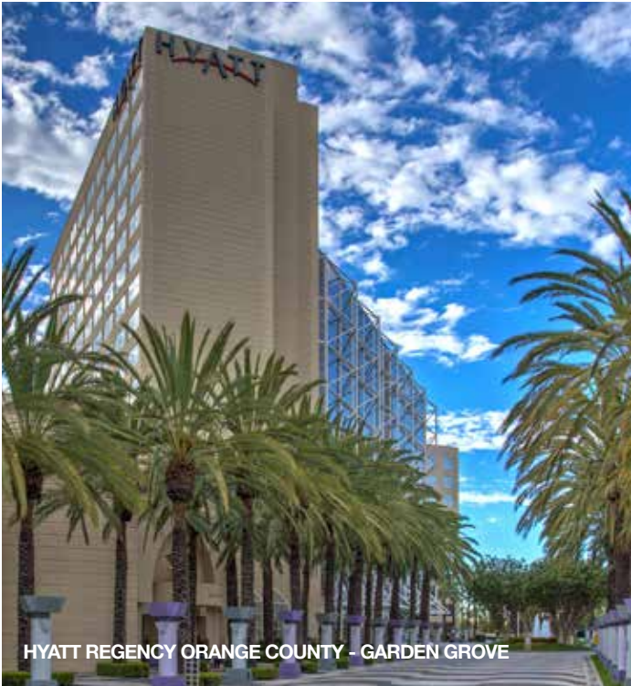
HYATT REGENCY ORANGE COUNTY - GARDEN GROVE

Discover Orange County's collection of distinct cities, incredible diversity of cultures, attractions, hotels, restaurants, museums, and experiences. From 42-miles of Pacific coastline to bustling urban centers, Orange County has everything you need to host your next perfect event while keeping attendees entertained and inspired.