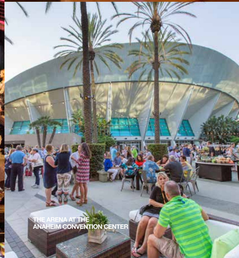
THE ARENA AT THE ANAHEIM CONVENTION CENTER