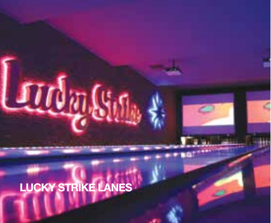
LUCKY STRIKE LANES

Anaheim | 1/2 mile from ACC Buyout Capacity: 900 Part of the GardenWalk scene, the recently relaunched Rumba Room Live in Anaheim brings its exciting blend of energy and elegance to Anaheim featuring an expansive stage and dance floor, state-of-the-art sound and lighting. The venue's combination of live entertainment, appealing menu and VIP bottle service in an ultra sophisticated and stylish setting is sure to captivate you.