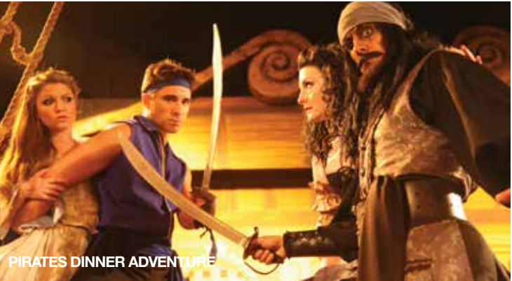
PIRATES DINNER ADVENTURE