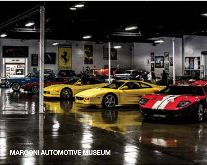
MARCONI AUTOMOTIVE MUSEUM

Yorba Linda | 11 miles from ACC Buyout Capacity: 800 Events are immediately memorable when guests move through this stunning replica of the historic White House East Room or reception, for candlelight dining or dancing. Massive crystal chandeliers, golden silk drapery, imported marble fireplaces and other adornments around this nine-acre venue provide an intimate glimpse into the life of the 37th U.S. President.