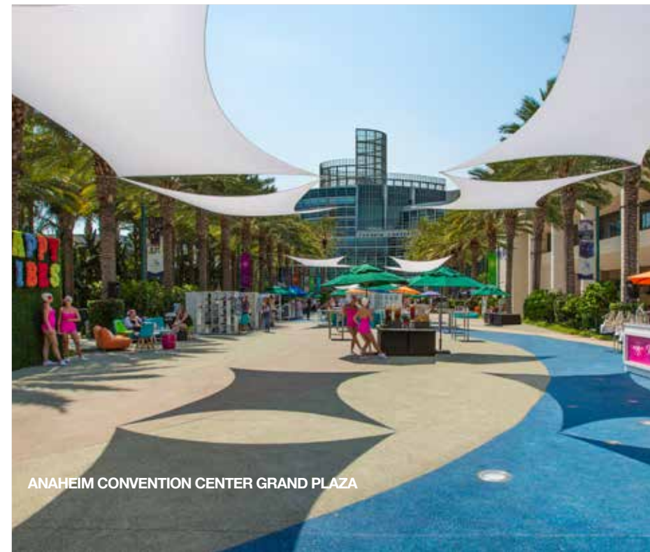
ANAHEIM CONVENTION CENTER GRAND PLAZA

For more information, check out visitanaheim.org/meetings