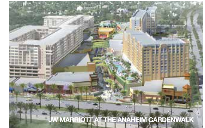
JW MARRIOTT AT THE ANAHEIM GARDENWALK

A new luxury hotel to replace the Anaheim Plaza Hotel & Suites will be located on the corner of Harbor Blvd. and Disney Way. The 580-room property will have two signature restaurants, swimming pools, 50,000 square feet of meeting space and a lounge overlooking the Disneyland ® Resort. Construction on the $208 million hotel has not yet begun.