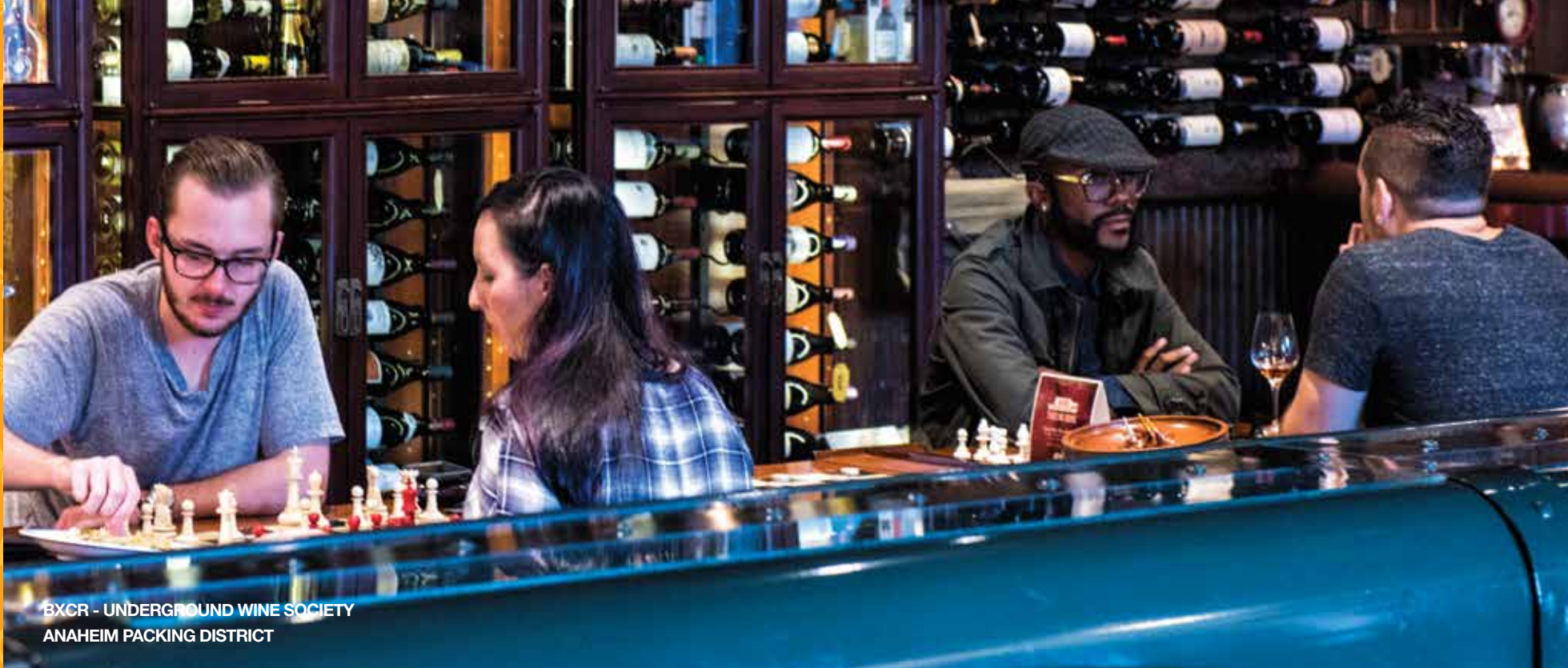
BXCR - UNDERGROUND WINE SOCIETY ANAHEIM PACKING DISTRICT