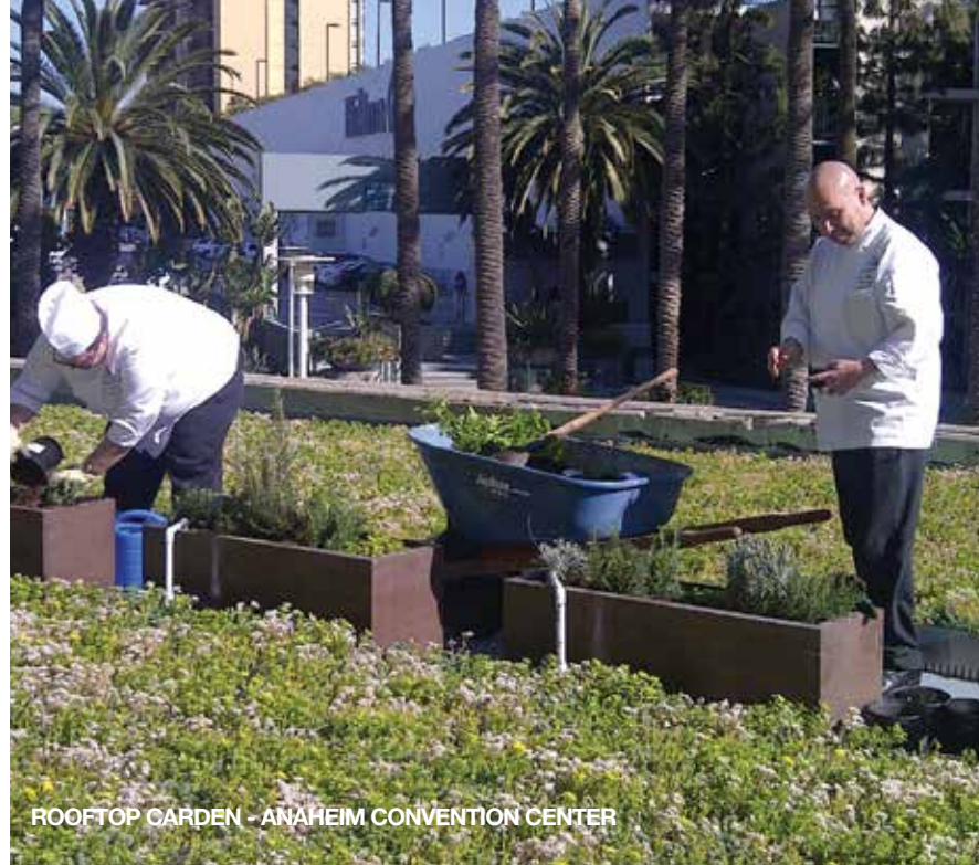
ROOFTOP GARDEN - ANAHEIM CONVENTION CENTER