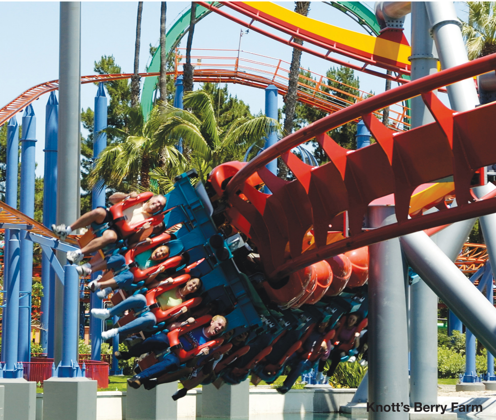
Knott's Berry Farm

Orange County is made up of 27 cities, many just minutes from the sand. There are plenty of gems to be found in smaller communities, including those of Fullerton, Orange and Buena Park.