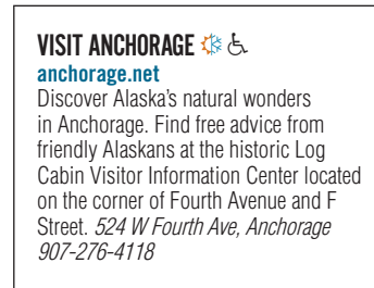
Directory listing with additional 150 characters

Note: Materials are subject to Visit Anchorage review/approval, and member is responsible for printing and shipping insert to Portland, Oregon.