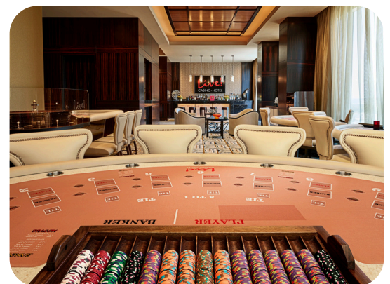
Live! Casino & Hotel

Head to Live! Casino & Hotel for world class live entertainment, an international selection of fine food and beverages, and high-end casino games of all kinds. Washington himself enjoyed games of cards and horseracing, while Jefferson's account books record a number of wagers between 1760-1780.