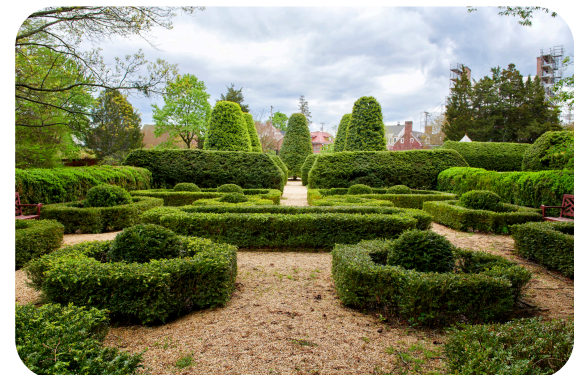
William Paca House & Garden