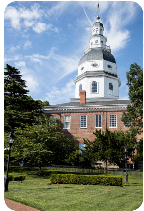
Maryland State House

Start the day with a walking tour from Watermark Tours , taking in the same sites and views our Founding Fathers once did. The Colonial Annapolis & Maryland State House Walking Tour shares four centuries of Annapolitan history and introduces visitors to the people and events which influenced the landscape of the city today. Proceed to the Maryland State House, which served as the nation's capital, and is where George Washington resigned his commission as head of the Continental Army in 1783 and the Treaty of Paris was signed formally ending the Revolutionary War.