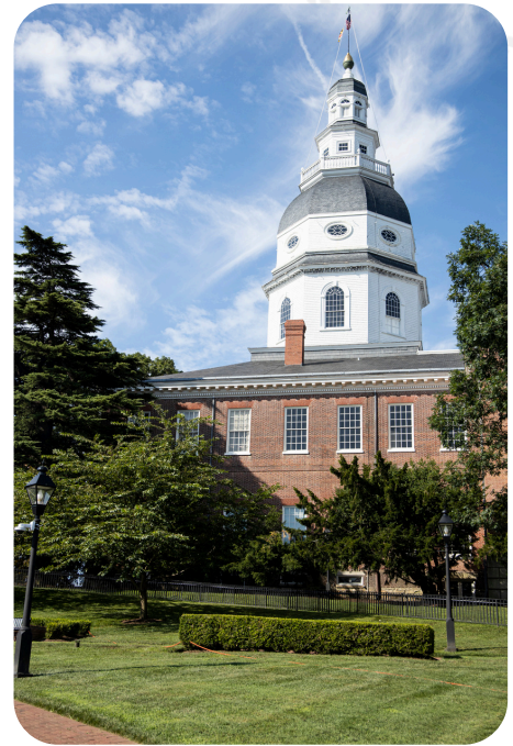
Maryland State House

Take to the streets with a Colonial Annapolis & Maryland State House Walking Tour by Watermark Tours and follow your guide as they share over 400 years of Annapolis history as you visit the same sights and walk the same streets as Washington and Jefferson did. See the homes of three signers of the Declaration of Independence. Proceed into the Maryland State House , the oldest continuously used legislative building in the United States that once served as the nation's capital, and see the exact spot where Washington stood to resign as head of the Continental Army. In the rotunda, visitors can view the actual paper from which he read his speech to Congress. Be inspired by the interweaving of time – modern laws made in the shadow of the legacy of American giants.