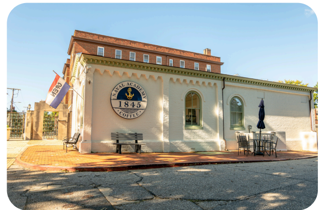
1845 Coffee House

At noon, make your way to T-Court outside of Bancroft Hall to view noon meal formation , a tradition going back to 1905. There are all sorts of lunch options on the Yard ranging from casual food trucks to coffee and pastries at 1845 Coffee , to the Alley , which serves classic fare in the lower level of the Naval Academy Club.