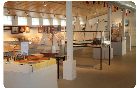
Annapolis Maritime Museum