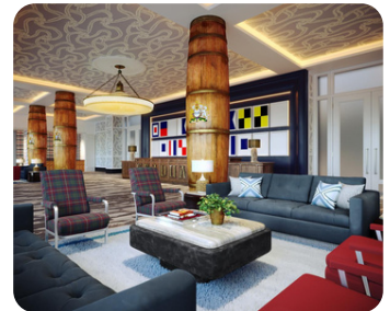
The Graduate Hotel