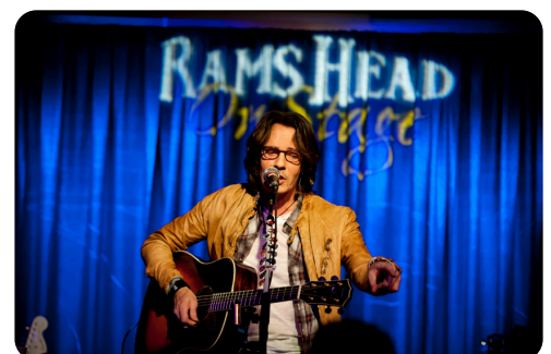
Rams Head On Stage