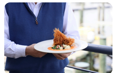
Carrol's Creek Café