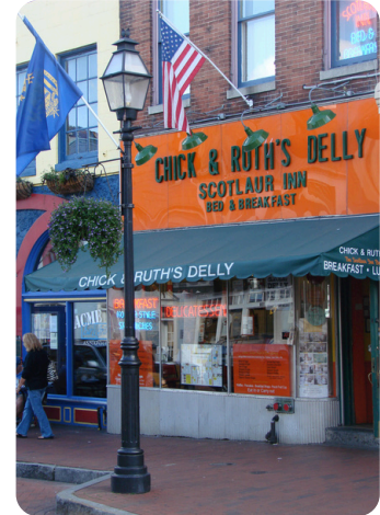
Chick & Ruth's Delly

Optional: Rams Head On Stage for a live music performance to end the night on a high note.