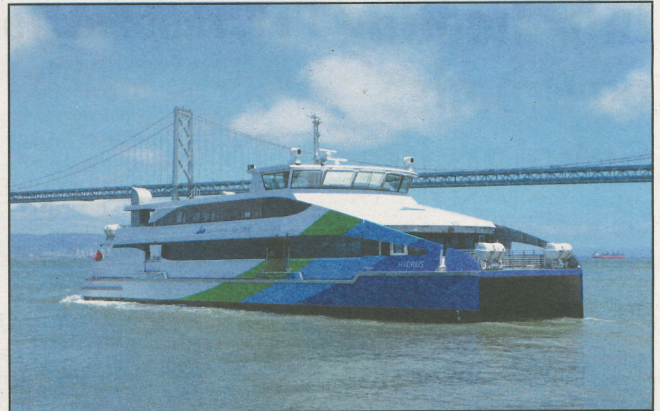
The hydrofoil Hydrus provides passenger service in San Francisco Bay. A request for proposals to study to see if a similar passenger ferry service could work in Chesapeake Bay is now being advertised with Crisfield among the first tier of participating ports.