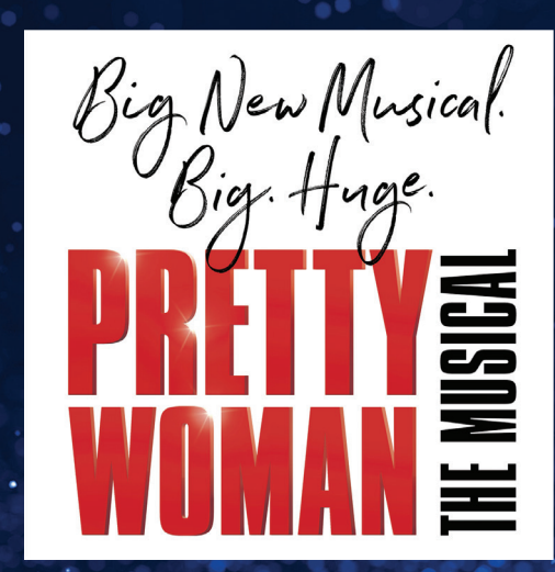
March 13, 2025