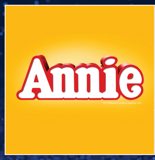
May 1, 2025