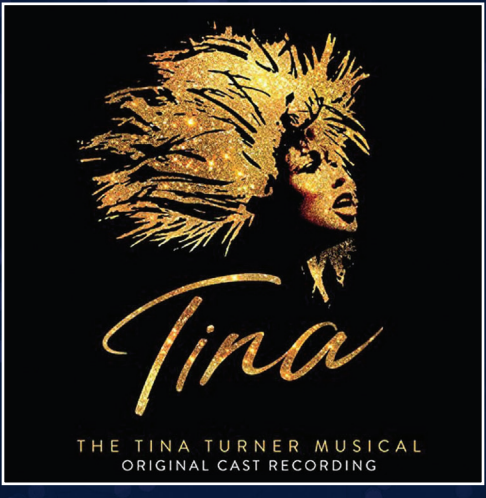
December 18, 2024