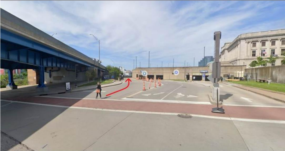
1139 W 3rd Street, Cleveland, OH 44113 (Stay left of the parking garage lanes and follow the red arrow)