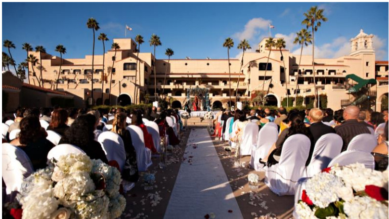
PLAZA DE MEXICO

Sunny days and starry nights set the stage for your event to shine in impressive outdoor plazas lined with manicured landscaping and ornate fountains to underpin the Spanish Architecture. Adjoining indoor banquet halls and breakout spaces allow for ultimate flexibility to craft meaningful moments.