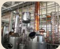
Oak House Distillery Macon Hwy