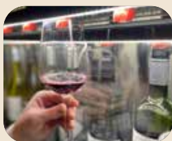
Tapped Athens The Bottleworks