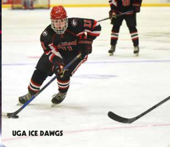
UGA ICE DAWGS