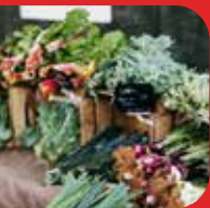
FARMERS MARKETS Wednesdays and Saturdays 🐾