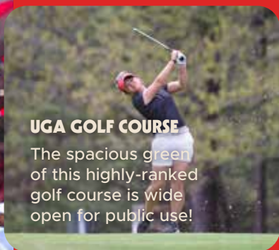
UGA GOLF COURSE

The spacious green of this highly-ranked golf course is wide open for public use!