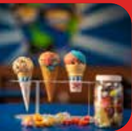
COOL WORLD Gaines School Rd. 🐾