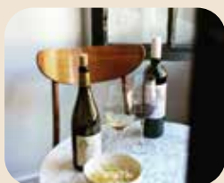
The Lark Winespace Downtown