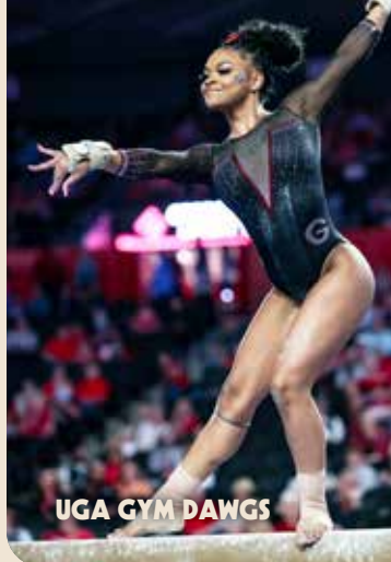
UGA GYM DAWGS