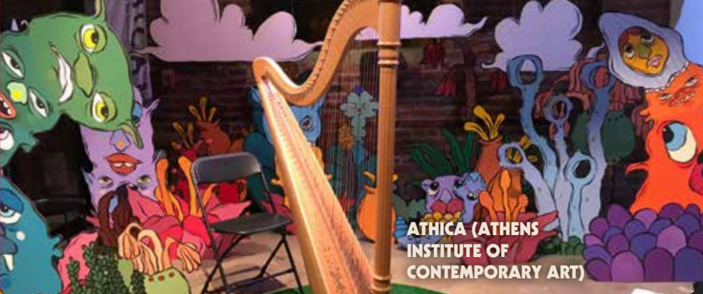
ATHICA (ATHENS INSTITUTE OF CONTEMPORARY ART)