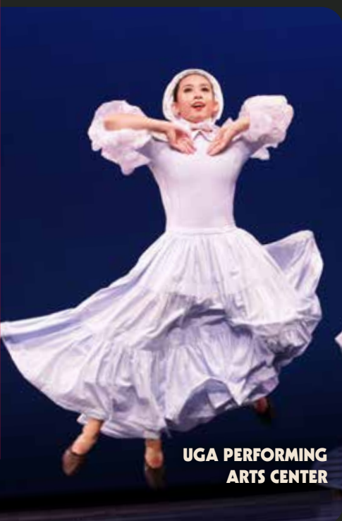
UGA PERFORMING ARTS CENTER