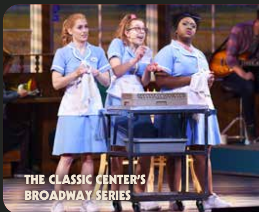
THE CLASSIC CENTER'S BROADWAY SERIES