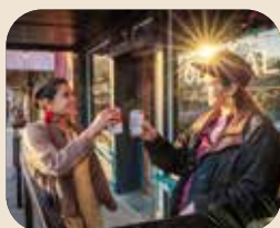
The Old Pal 🐾 Normaltown