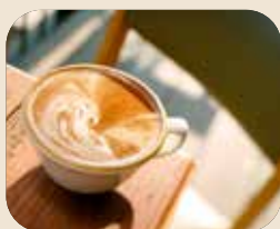
Jittery Joes 🐾 All over Athens