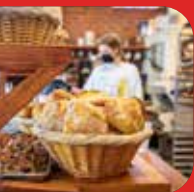
INDEPENDENT BAKING COMPANY Five Points