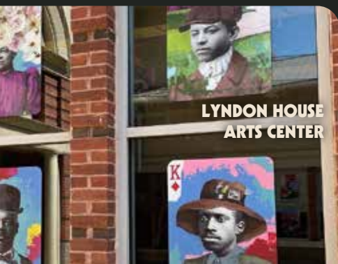
LYNDON HOUSE ARTS CENTER