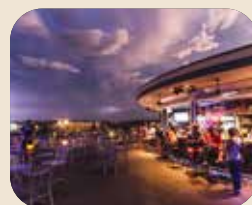
Georgia Theatre Rooftop Downtown