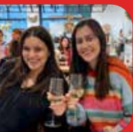
ATHENS COOKS Downtown