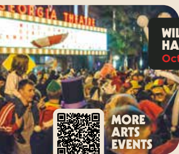
WILD RUMPUS HALLOWEEN PARADE October