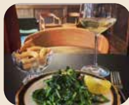
Bar Bruno 🐾 Five Points