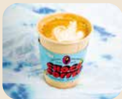
Choco Pronto College Ave