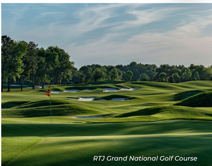
RTJ Grand National Golf Course

Robert Trent Jones himself proclaimed Grand National the “single greatest site for a golf course” he had ever seen. Grand National has received accolades for everything from the “world’s prettiest hole” to the “world’s best public course.”