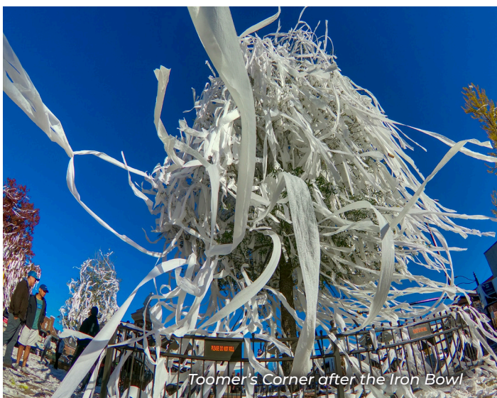
Toomer's Corner after the Iron Bowl

One of Auburn's oldest and most renowned traditions, thousands of AU faithful will join in downtown Auburn to celebrate tiger victories by hurling tissue into the surrounding trees, lamp posts, and anything that will stand still long enough.