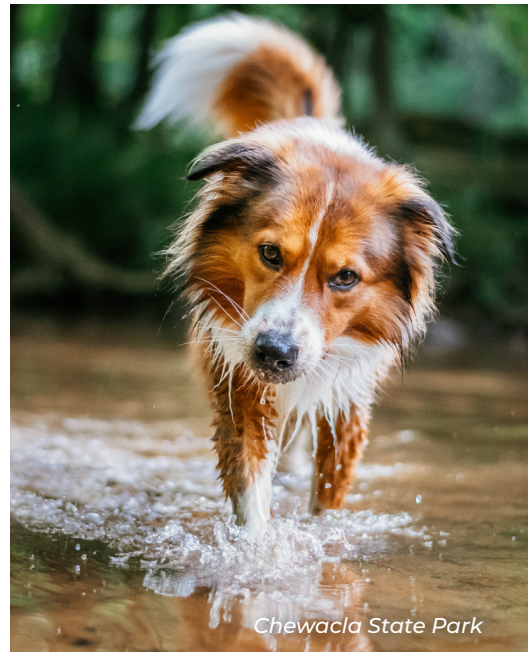
Chewacla State Park