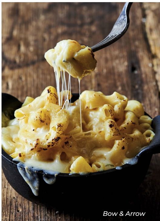
Bow & Arrow