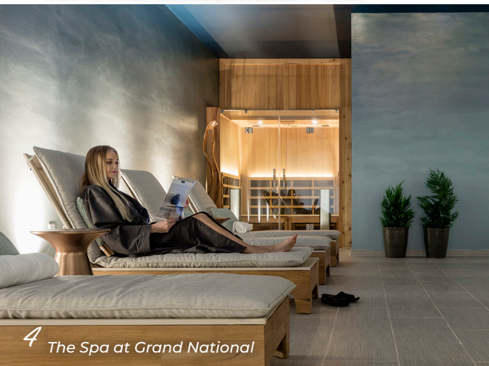
4 The Spa at Grand National

Opelika boasts not one, but three craft spirit makers: John Emerald Distilling Co., Red Clay Brewing Co., and Resting Pulse Brewing Co. Nestled in the vibrant 1st Avenue district of historic downtown Opelika, these establishments offer a diverse range of artisanal libations. And let's not overlook New Realm Brewing Company within the Rane Culinary Science Center!