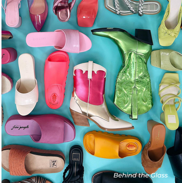
Behind the Glass