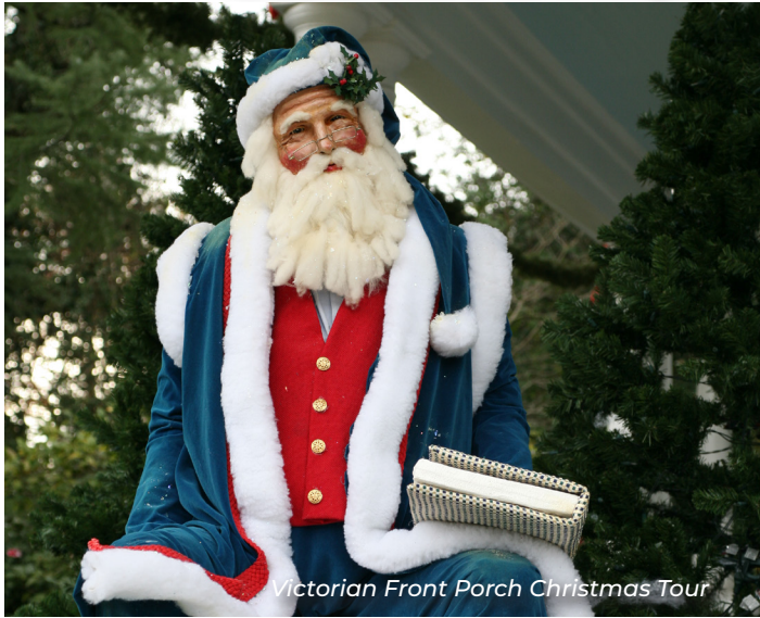
Victorian Front Porch Christmas Tour

We're making spirits bright with a full list of holiday festivities for you and your family to enjoy! From one-of-a-kind annual events to carol concerts, tree lightings, and one of the largest gingerbread villages in the Southeast, we've got everything you need to celebrate your reason for the season.