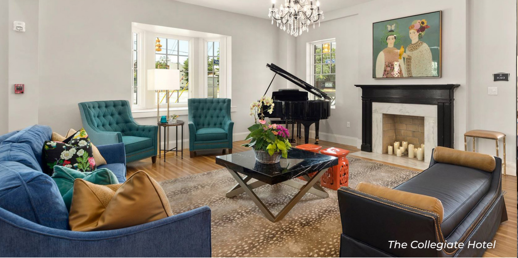
The Collegiate Hotel

For full details on accommodations, including amenities, photos, and proximity to area attractions, visit us online at AOTourism.com .