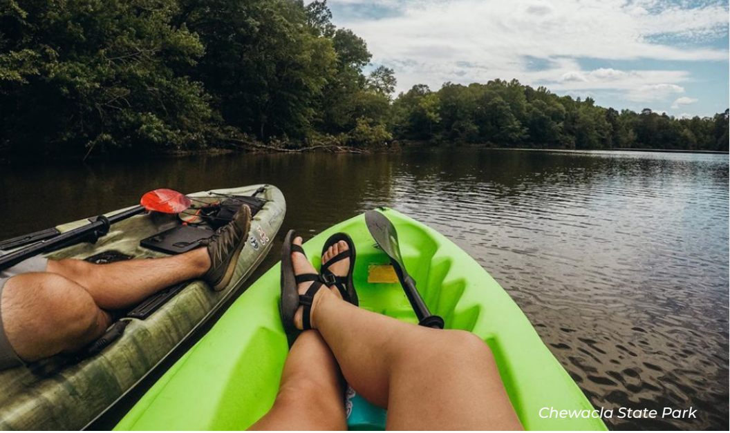
Chewacla State Park

F rom parks to play bills, we offer a variety of places and ways for your family to unplug and engage. Both cities offer spacious, well-maintained parks and facilities for outdoor play or spectator sports, and Auburn University has a full calendar of events so you can take in some of the best collegiate sports action in the U.S.