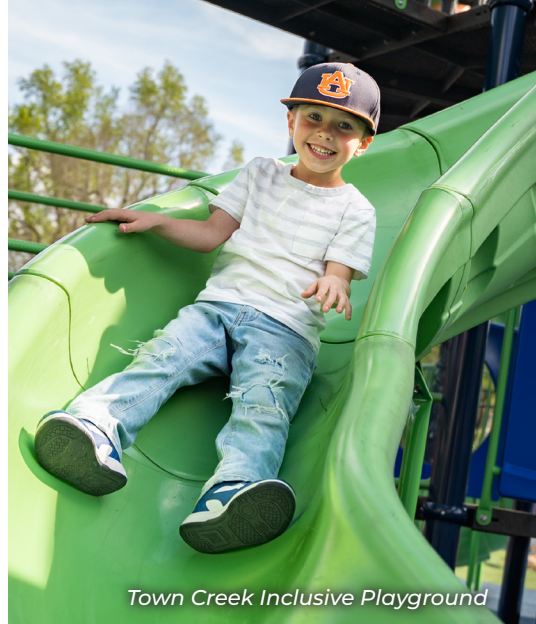
Town Creek Inclusive Playground