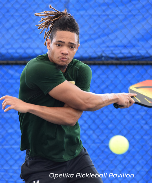
Opelika Pickleball Pavilion