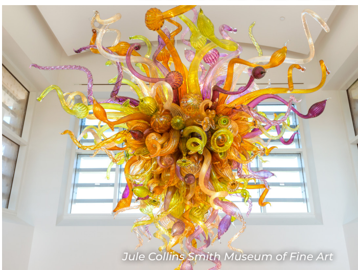
Jule Collins Smith Museum of Fine Art

The focal point for the entry of the Jule Collins Smith Museum of Fine Art at Auburn University, Chihuly's Amber Luster is a masterpiece of more than 600 individual pieces of hand-blown glass. The process took four days to install, one piece at a time.