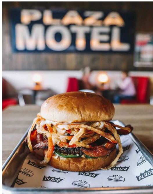
Auburn Plaza Bar & Lounge