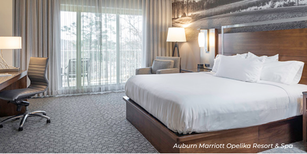
Auburn Marriott Opelika Resort & Spa

Candlewood Suites 2510 E. Glenn Avenue • 521-7494