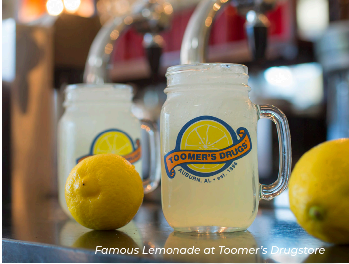
Famous Lemonade at Toomer's Drugstore

When Toomer's lemonade ranked No. 1 in Esquire's "162 Reasons It's Good To Be An American," it was only about 105 years after the rest of us already knew. Hand-made to order, this tart & tangy concoction is the hallmark of Toomer's Drugstore, a beloved Auburn icon occupying the same corner since 1896.