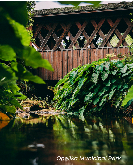
Opelika Municipal Park

Home of a vintage miniature train, the beloved Rocky Brook Rocket, and the relocated Salem-Shotwell covered bridge. The park offers children's play areas and equipment and features a pavilion and gazebo with picnic areas available to rent for private functions. Home of Summer Swing. Open sunrise to sunset. Park Rd, Opelika · 334-705-5549