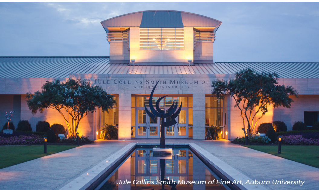
Jule Collins Smith Museum of Fine Art, Auburn University

Scan for more info on the arts & culture in Auburn-Opelika