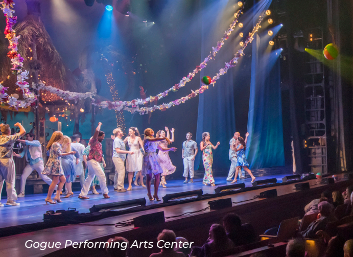
Gogue Performing Arts Center