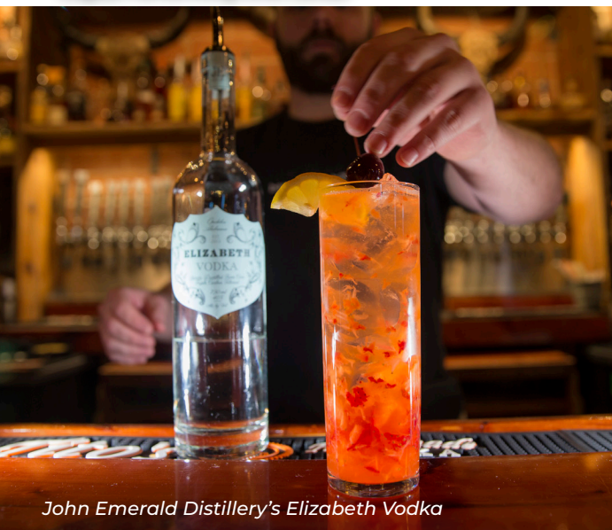
John Emerald Distillery's Elizabeth Vodka

Diverse, life-changing arts experiences designed to entertain, educate, and unite. Year-round opportunities to engage in the arts are available throughout the Auburn-Opelika community. Explore Broadway performances, songwriters festivals, and more.