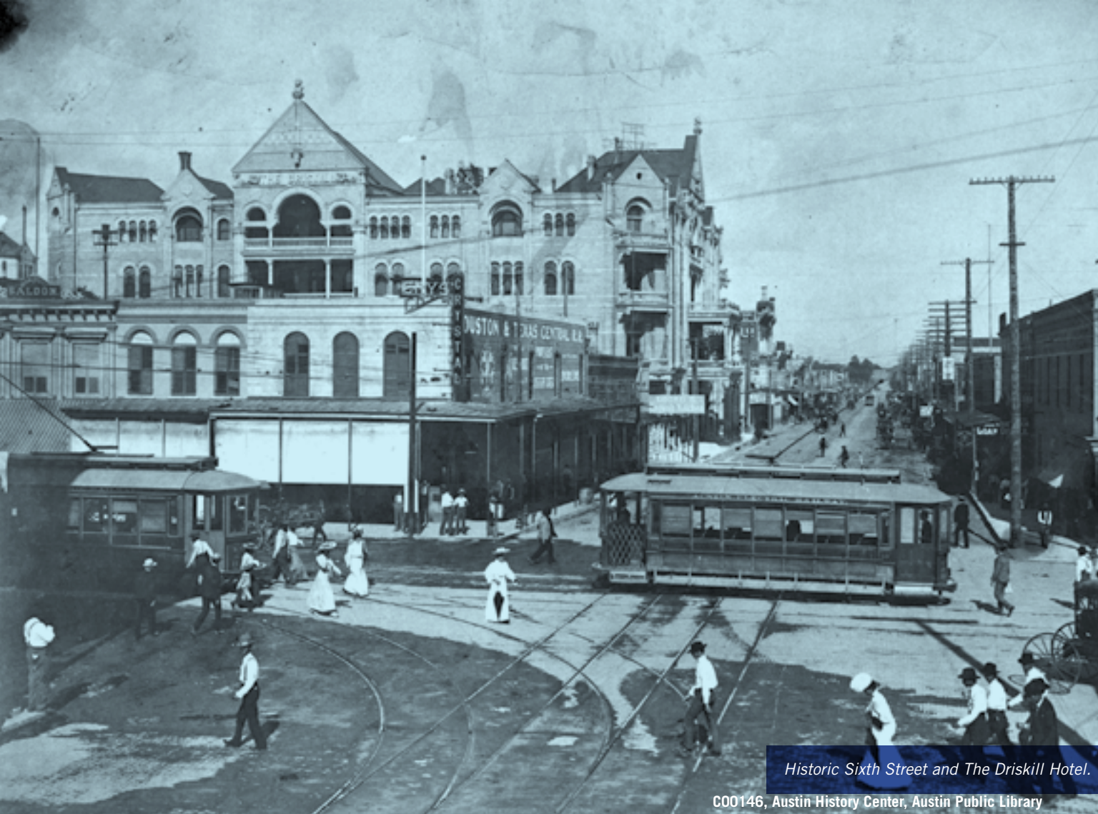
Historic Sixth Street and The Driskill Hotel.