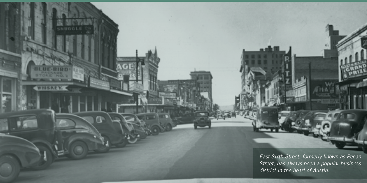
East Sixth Street, formerly known as Pecan Street, has always been a popular business district in the heart of Austin.