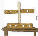
OLD COUNTY JAIL