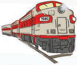
MY OLD KENTUCKY HOME DINNER TRAIN