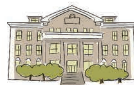
SISTER OF CHARITY OF NAZARETH