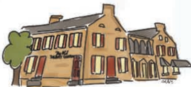
OLD TALBOTT TAVERN