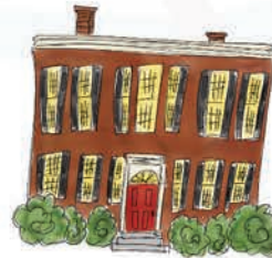
MY OLD KENTUCKY HOME STATE PARK