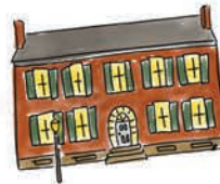
WICKLAND HOME OF 3 GOVERNORS