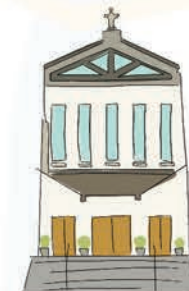
ABBEY OF GETHSEMANI