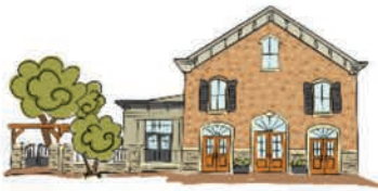
SCOUT & SCHOLAR BREWING COMPANY