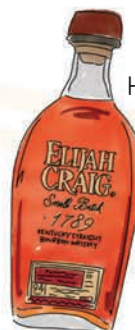
HEAVEN HILL BOURBON EXPERIENCE