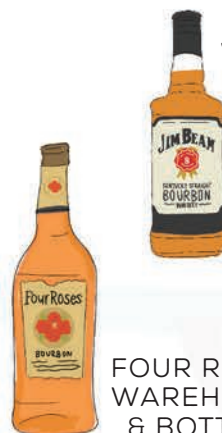
JAMES B. BEAM DISTILLING CO.

In Bardstown, history isn't just something confined to the past—it's a vibrant part of everyday life, shaping the town's identity and fostering a sense of community pride. As visitors explore its cobblestone streets and historic sites, they're not just witnessing history; they're experiencing the very essence of what makes Bardstown the beloved town it is today. So come, immerse yourself in the timeless beauty and warm hospitality of Bardstown, where the past meets the present in perfect harmony.