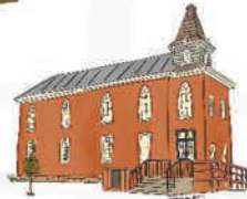
AFRICAN AMERICAN MUSEUM