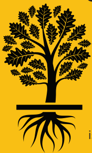
Chart your family tree