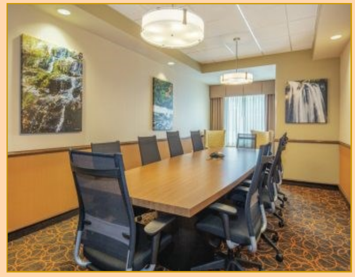
THE KINGSWOOD—300 square feet/1 window, interior door, restrooms across hall.

Count on us! Choose from 107 beautiful guest rooms on three floors and 3 meeting room options totaling 1900 sq. ft. of event space on first floor with ample parking.