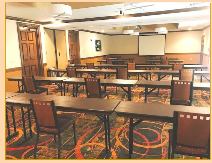
THE CREEKS—1150 square feet,2 windows, exterior and interior doors, restrooms across the hall.