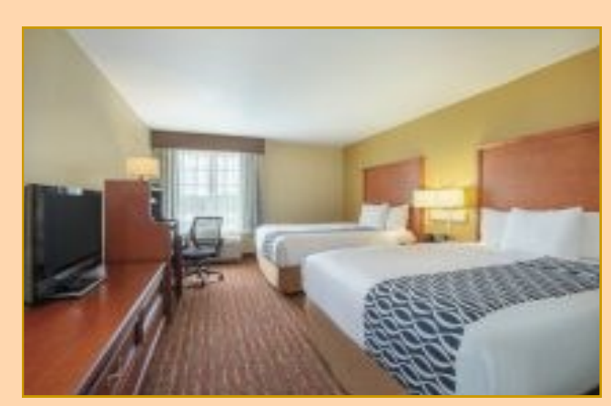
Reserve a minimum of 5 rooms and receive a 50% discount off meeting space.

All rooms: microwave, refrigerator, coffee maker, iron and hair dryer.