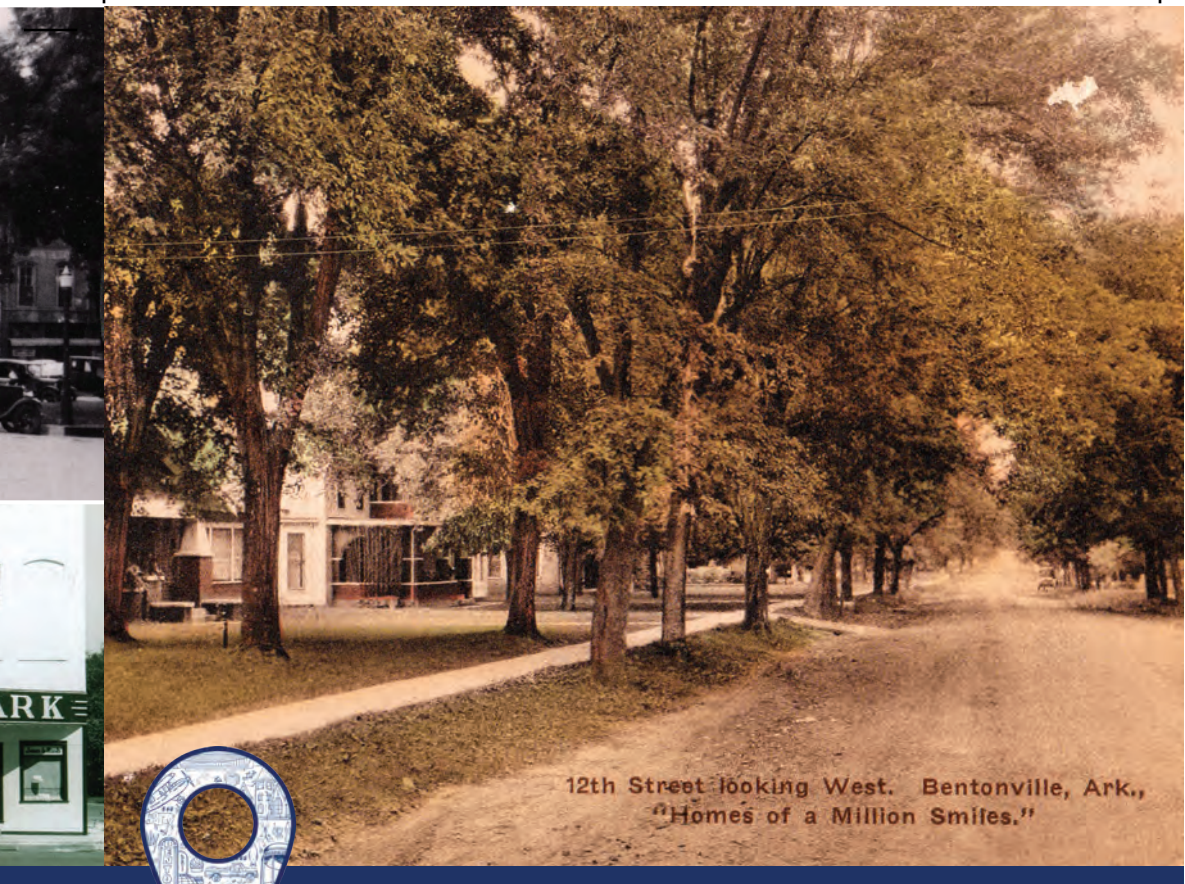
12th Street looking West. Bentonville, Ark., "Homes of a Million Smiles."