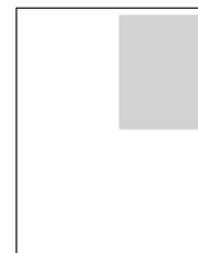
1/4 Page 3.25" x 4.35"