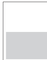
1/2 Page Horizontal 6.675" x 4.35"