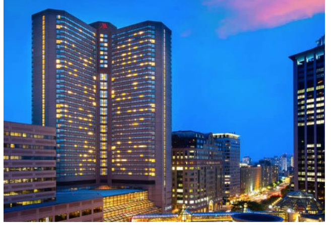
Boston Marriott Copley Place