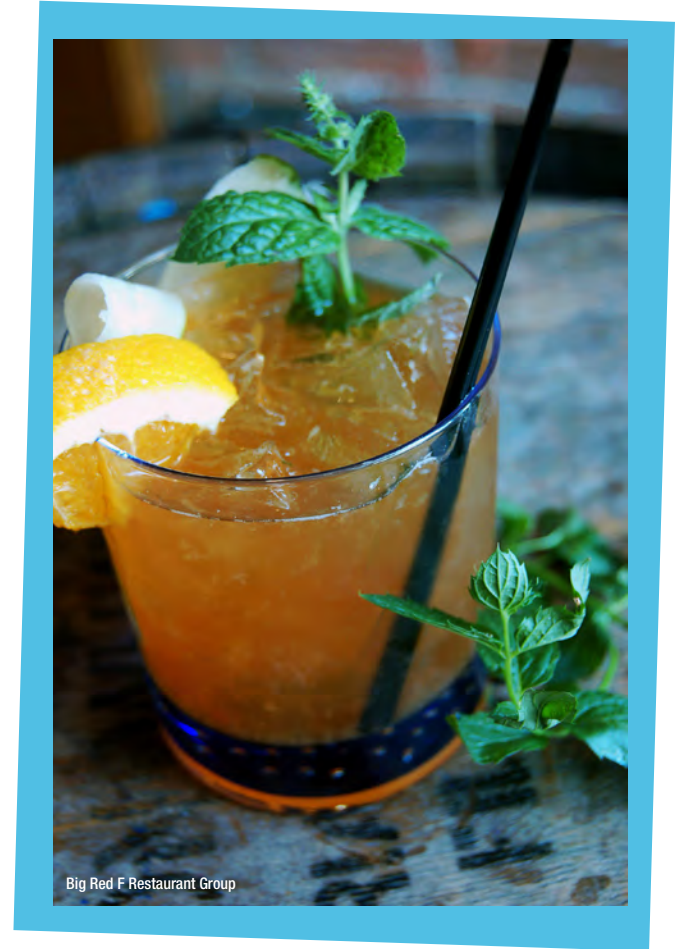
Big Red F Restaurant Group