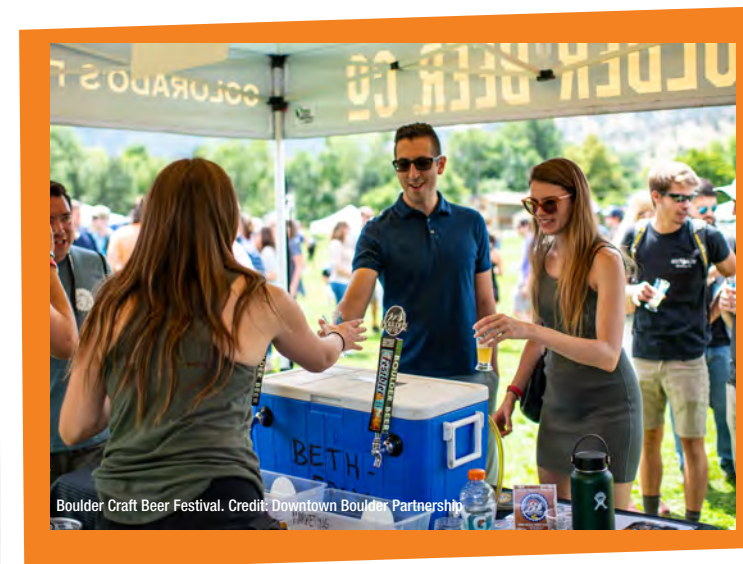
Boulder Craft Beer Festival.

Talks, tastings and meals focusing on old and rare Burgundies, held at various locations around town.