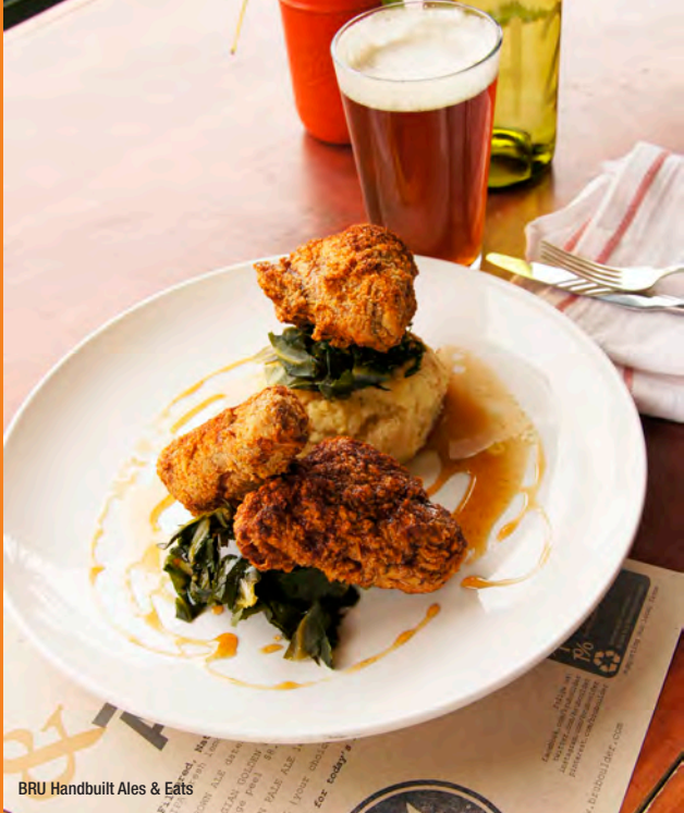
BRU Handbuilt Ales & Eats

Boulder is home to the Brewers Association (which represents the nation's small and independent craft brewers) and the American Homebrewers Association. This is a town full of beer geeks!