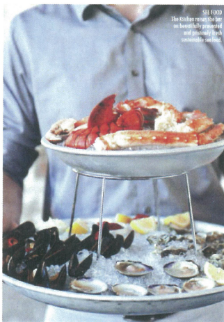
SEE FOOD The Kitchen raises the bar on beautifully presented and positively fresh sustainable seafood.

At the Dushanbe Tea House ( boulderteahouse.com ), you'll sip as you savor in surroundings so serene and ornate, you'll want to wear your silkliest shift. But it's Boulder, so the dress code is anything but Downton Abbey formal. The hand-carved, hand-painted and hand-adorned structure was a gift from Boulder's sister city, Dushanbe in Tajikistan. It took 40 Tajik craftsmen more than three years to build it in the fashion of their homeland. Serving more than 100 types of tea and gastronomic cuisine, you'll find it downtown near the university. Afternoon tea $22 per person