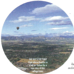
THE ONLY THE TOWN Boulder shows Boulder is a jet-set balloon for a new view of this college town.

With top-of-the-line casting products, the store can make a fishing aficionado out of anyone. Stellar summer youth camps and adult courses instill a passion for this relaxing, patience-teaching sport. Past the beginner phase? Sign up for a guided excursion to a fast-flowing mountain river or high-altitude lake. Guided trips from $195. rockymountainanglers.com