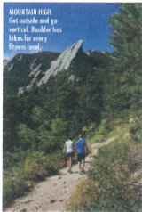
MOUNTAIN HIGH Get outside and go vertical. Boulder has lakes for every fitness level.

Some say Boulder has a reputation as a party school, but you won't believe it when the sportswear-clad locals leave you in the dust. This is one fit city. Put on some hiking boots and join the fun. Myriad trails twist into the mountains above the town. Others extend through a carpet of grassland to the east. A must-conquer for first-time visitors? Royal Arch—a pine-scented ascent from the mountain's base at Chautauqua State Park to a scenic overlook, shaded by a dome-shaped rock. chautauqua.com