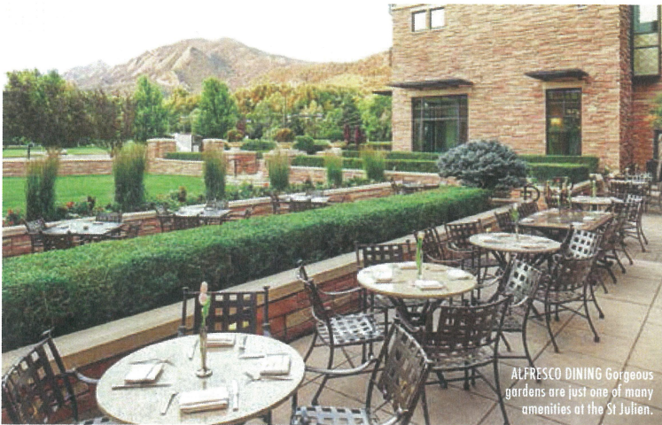
ALFRESCO DINING Gorgeous gardens are just one of many amenities at the St Julien.

Who needs snow? Savvy travelers know Boulder, Colo., best as a summer retreat. A sun-drenched university town, this hip, mountain-fringed village lies just 40 minutes from Denver. With cool summer nights and temperate days, it draws its denizens outdoors to play. Come hungry for its rising food culture and fitness-ready for its high-energy mountain pace. On the Pearl Street (pedestrian) Mall, you'll listen to street musicians and peruse independently owned shops. On the grassy lawn at Chautauqua State Park, you'll picnic into the wee hours. And at night, you'll sit beneath the stars while Shakespeare thrills you with each soliloquy. That's the Boulder way.