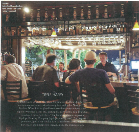
OBERS! In this food-forward college town, Boulder's bar scene swings 'em round.