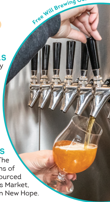
Free Will Brewing Co.

Shopping lovers can discover Peddler's Village, The Square in Dublin, The Shops at Valley Square and tons of antique shops. Food lovers can enjoy locally sourced markets such as the Quakertown Farmer's Market, The Market at Delval and the Ferry Market in New Hope.