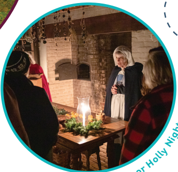
Pennsbury Manor Holly Nights