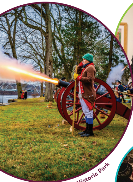
Washington Crossing Historic Park