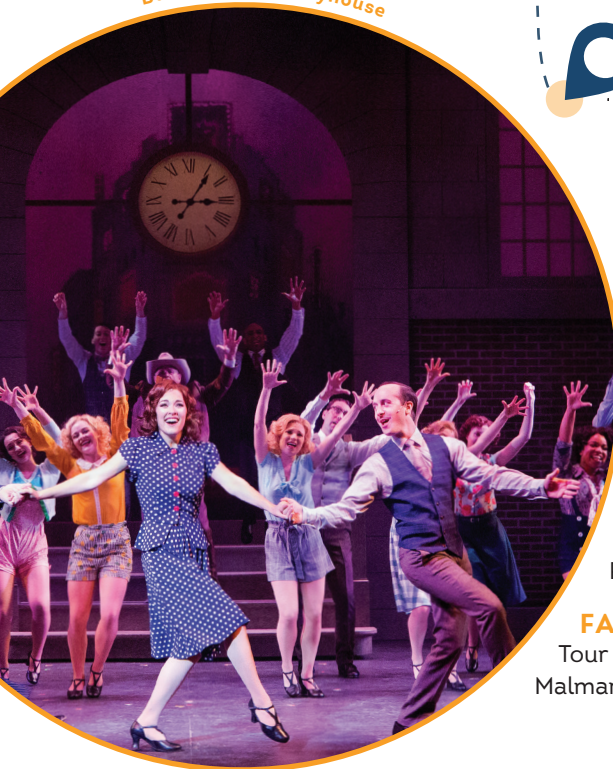
Bucks County Playhouse