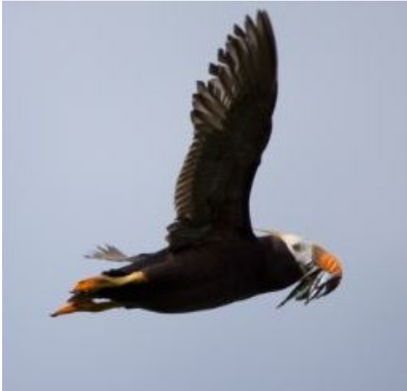
Tufted Puffin in flight.

On the south facing cliffs of Haystack Rock, the lanky, greenish-black Pelagic Cormorant builds nests of seaweed on precarious narrow ledges high above the surf. These birds are