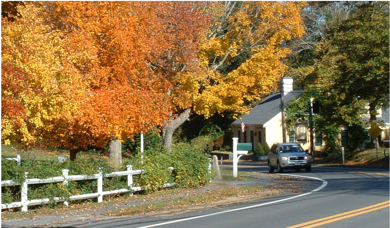
Old King's Highway, Yarmouth Port

2021 designation makes it one of four in Massachusetts