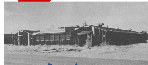
Post Exchange