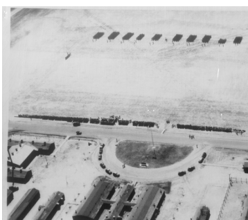
Base Headquarters Building & Flag Pole