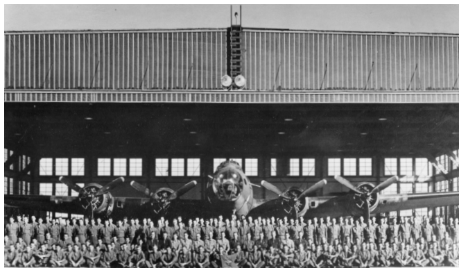
461st Bombardment Squadron in front of Hangar

Wyoming Veterans Memorial Museum Natrona County International Airport Casper College Western History Center