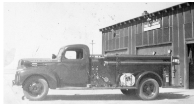
Army Air Force Ford Fire Engine at CAAB Crash House