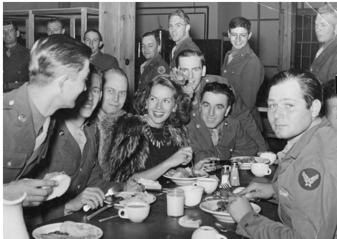
Jinx Falkenburg with Soldiers in Mess Hall