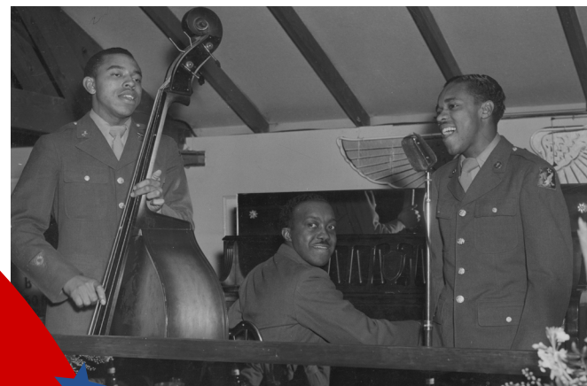
Jazz Band made up of African American soldiers from the 377th Aviation Squadron (WHC-CC)