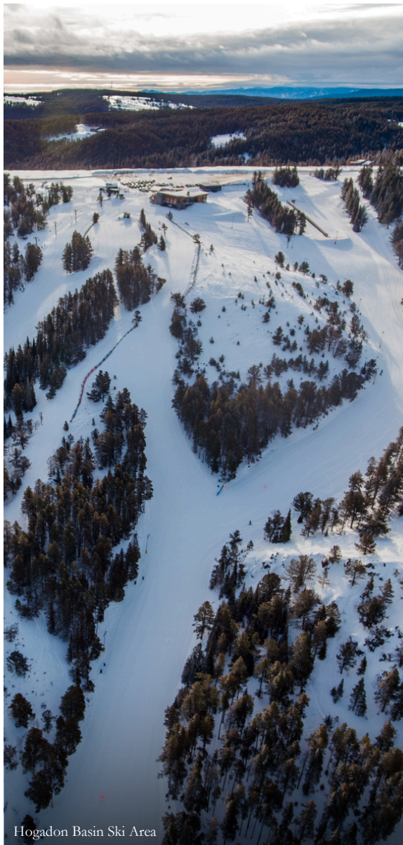
Hogadon Basin Ski Area