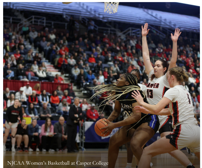
NJCAA Women's Basketball at Casper College