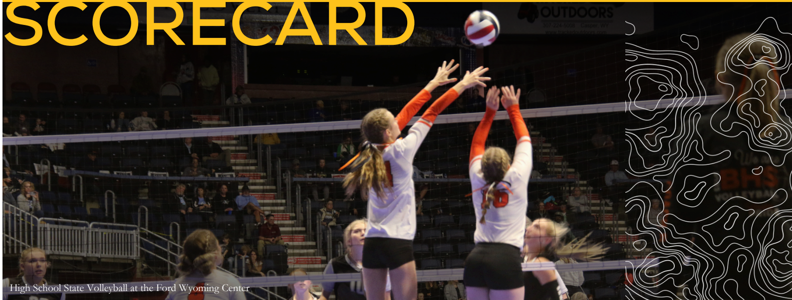
High School State Volleyball at the Ford Wyoming Center