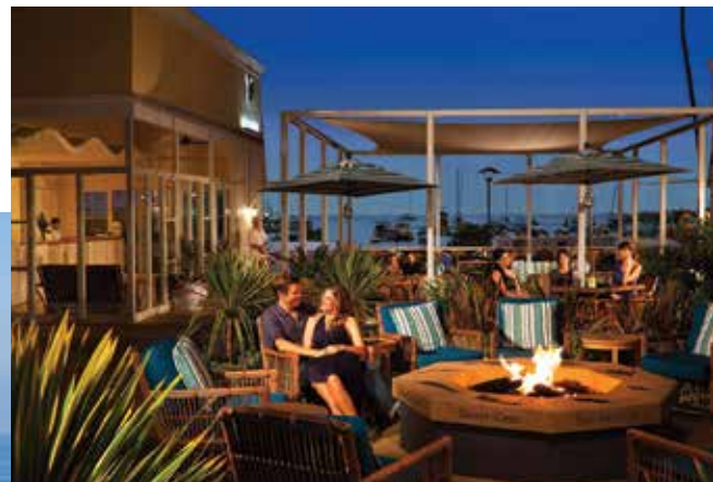
The circular Catalina Casino (left, on the far side of the bay) is an iconic landmark in the city of Avalon and home to a historic 1,184-seat movie theater (below). Pavilion Hotel guests gather in the courtyard (above), where full hot breakfasts and evening wine and cheese receptions are enhanced by ocean views.