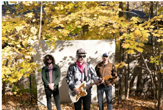
Dinosaur Jr, courtesy of Cara Totman

Doors open at 2pm, the music starts at 4:30 and runs until 8:30. For tickets and more information, visit https://www.etix.com/ticket/p/4911622/dinosaur-jr-cedar-park-lakeline-park .