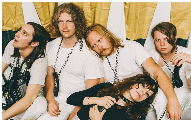
A Giant Dog

Grammy award-winning and multi-platinum selling rock band Soul Asylum started as Minneapolis' punk younger brothers to the Replacements and Husker Dü. Their 1992 breakthrough album, Grave Dancer's Union , featured the international hits "Runaway Train", "Black Gold" and "Somebody to Shove". "Runaway Train" won a Grammy, and its music video brought nearly two dozen missing and exploited children and teens around the world home to their families. SOUL ASYLUM has released 12 original albums, with multiple live albums and assorted Greatest Hits collections.