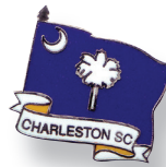
Lapel/hat pin (C)