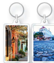
Key ring (F)