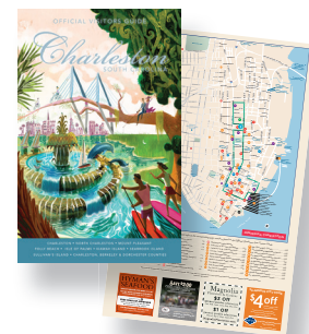
Official Charleston Area Visitors Guide with area maps (H)