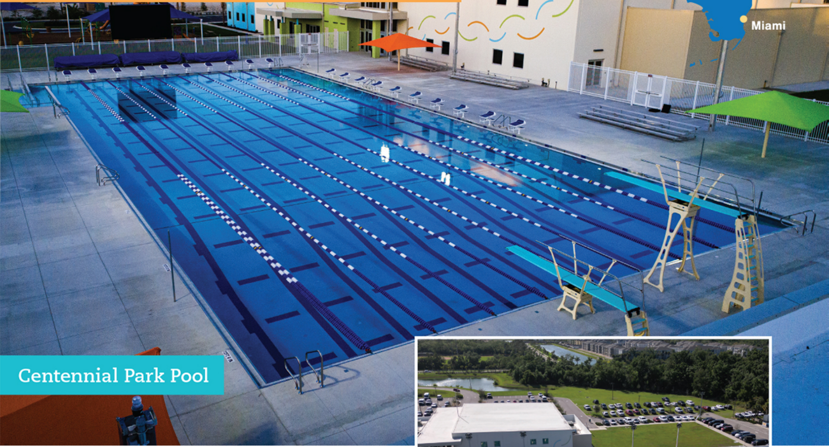
Centennial Park Pool