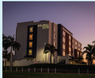
SpringHill Suites by Marriott Punta Gorda Harborside Rooms/Suites: 104