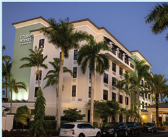
Four Points By Sheraton – Punta Gorda Harborside Rooms/Suites: 106