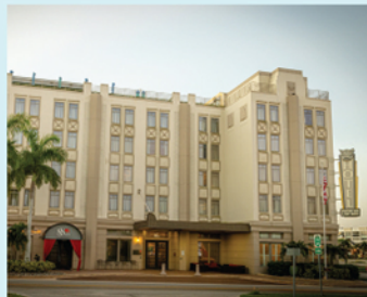
The Wyvern – An Ascend Collection Hotel Rooms: 63