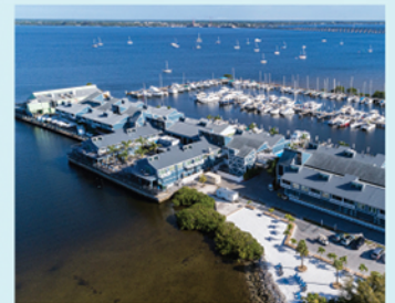
The Suites at Fishermen's Village Suites: 47