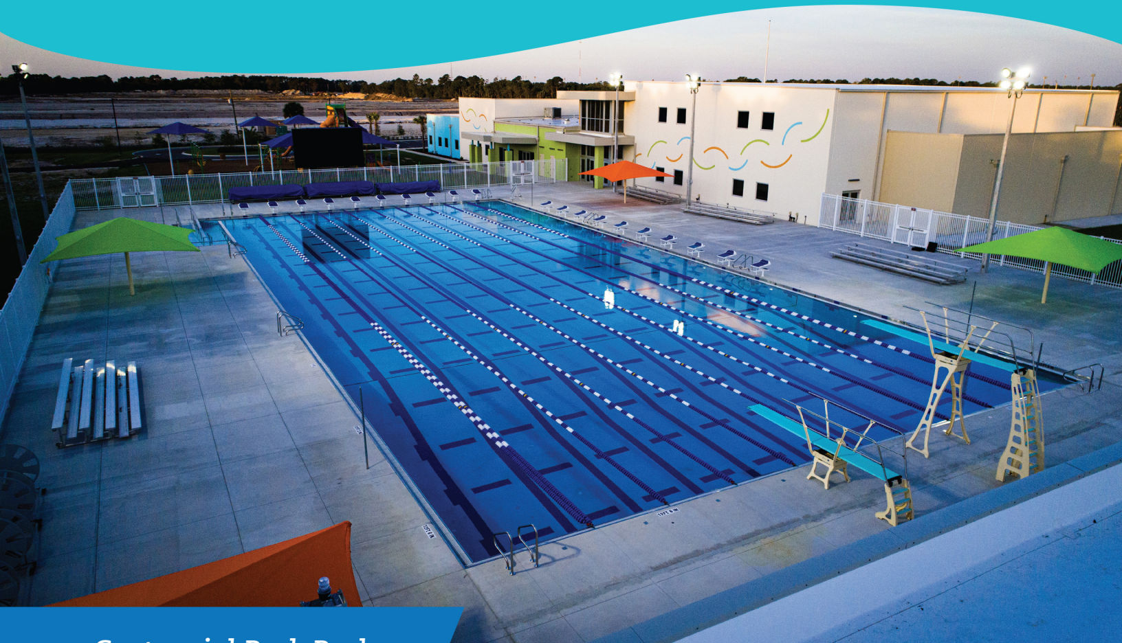
Centennial Park Pool