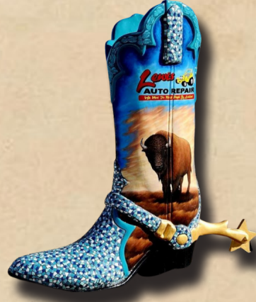
LEWIS AUTO REPAIR 285 North American Road Artist: Cody Hamil