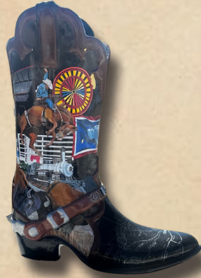
ENDODONTICS OF THE ROCKIES 5215 Hynds Boulevard Artist: Ross Lampshire