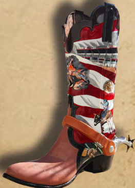
8-SECOND STEPS TO THE BIG TIME 1912 Capitol Avenue Artist: Ross Lampshire