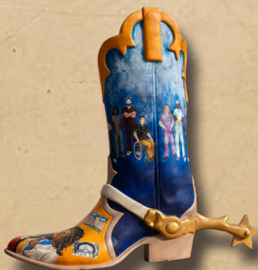
HONORING HEALTHCARE HEROES 214 E. 23rd Street Artist: Chad Blakely