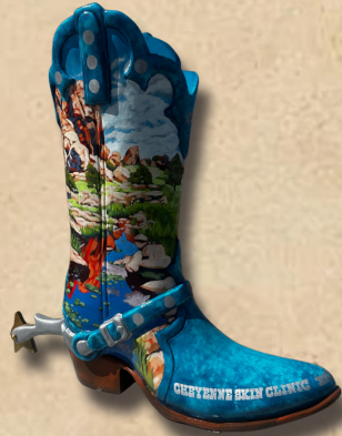
CHEYENNE SKIN CLINIC 123 Western Hills Boulevard Artist: James Overstreet