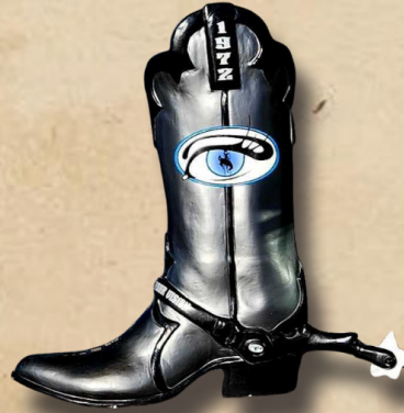
CHEYENNE VISION CLINIC 1854 Dell Range Boulevard Artist: SpeedEFX