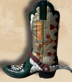
GAMBLERS BOOT 4610 Carey Avenue CFD Old West Museum Artist: Max Larkin