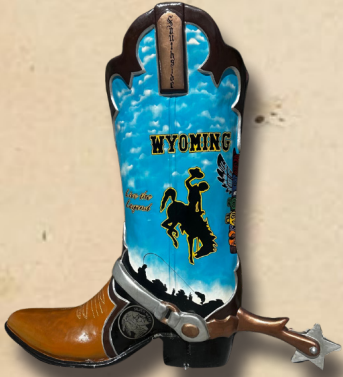
LINCOLN PARK BOOT 300 Block of E. 8th Street Artist: Esperanza Perez