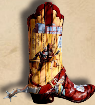
BOOK BOOT 2200 Pioneer Avenue Laramie County Library Artist: Max Larkin