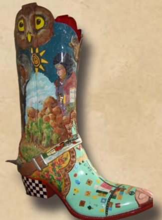
PEOPLE, PLACES, AND THINGS 311 Cleveland Place Artist: Deselms Fine Art Group