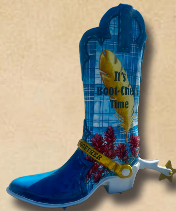
BLUE CROSS BLUE SHIELD 315 E. 7th Avenue Artist: James Overstreet