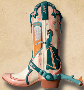
WYOMING WOMEN 1ST TO VOTE Capitol Avenue (between 17th & 18) Artist: Cathy Nicholas