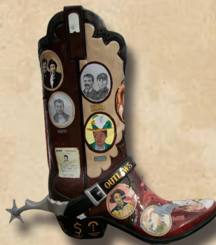
OUTLAWS OF WYOMING 1701 Morrie Avenue Cheyenne Artists Guild Artist: Cheyenne Artists Guild