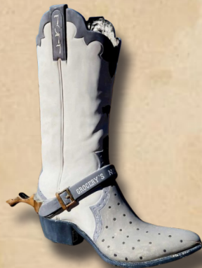
WALMART BOOT 426 Logistics Drive Walmart Distribution Center Artist: Amber Kubot