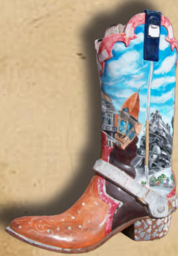
DOWNTOWN CHEYENNE Cheyenne Depot Plaza Artist: Various Artists