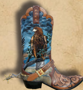
LCCC EAGLE EYE ON THE FUTURE 1400 E. College Drive Laramie County Community College Artist: Max Larkin