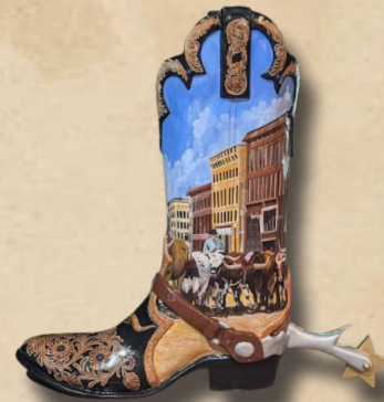
COMFORT INN AND SUITES 201 W. Fox Farm Road Artist: Ross Lampshire