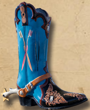
DENTAL ART 7010 Yellowstone Road Artist: Ross Lampshire