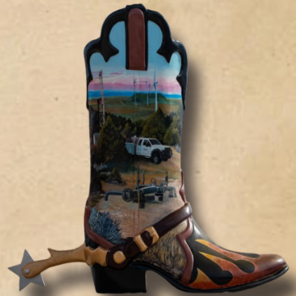
OUR LEGACY, IMPROVING LIFE WITH ENERGY 1301 W 24th Street Artist: Ross Lampshire