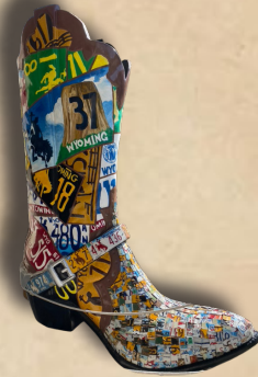
LICENSED TO BOOT 2301 Central Avenue Wyoming State Museum Artist: Carey Junior High Art Club