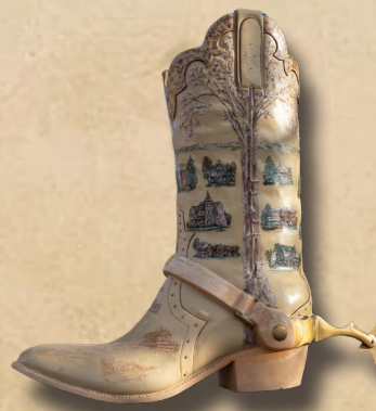
SPRINGTIME IN CHEYENNE 6106 Yellowstone Road #1 Properties Artist: Rose Burrows

ARTS CHEYENNE WORKS WITH THE CITY OF CHEYENNE AND OTHER COMMUNITY PARTNERS TO FACILITATE OUR 'PUBLIC ART PROGRAM'.