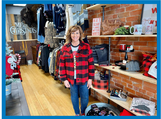
Roots 307 Boutique 1819 Carey Avenue

Women's clothing, shoes, accessories and more