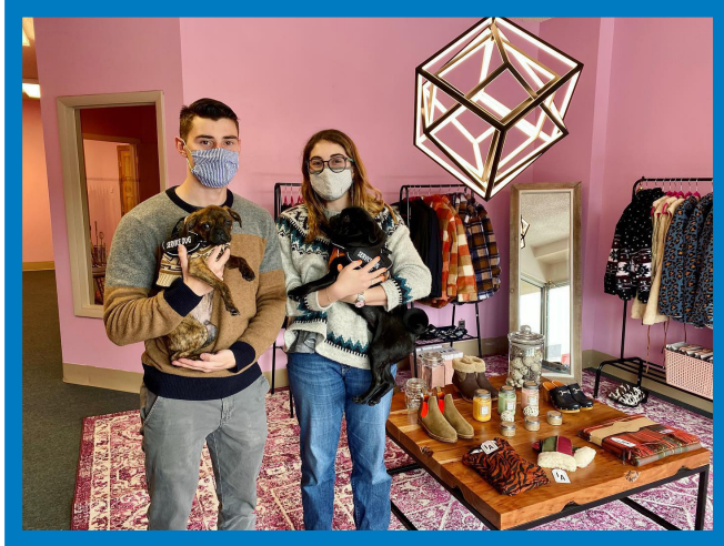
Instant Attraction Boutique 111 W 17th Street

Women's clothing, shoes, accessories and more