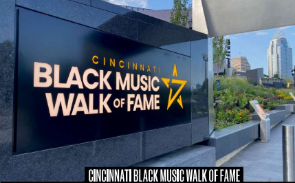
CINCINNATI BLACK MUSIC WALK OF FAME