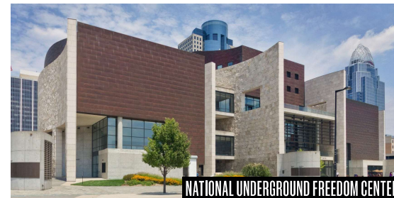
NATIONAL UNDERGROUND FREEDOM CENTER

The holidays come to life in Cincy as the Ark Encounter and Creation Museum host Christmas displays from November through years' end. Enjoy 12 different winter wonderlands at Kings Island Winterfest and fans of model trains will adore the wonderful holiday exhibit at the Cincinnati Museum Center. Don't forget to stop by the Cincinnati Zoo and Botanical Garden for their annual Festival of Lights and the various Christmas markets throughout the region.