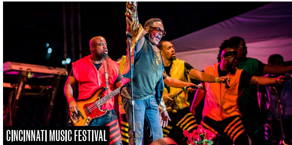
CINCINNATI MUSIC FESTIVAL

Top in their areas and a million gallons of fun.