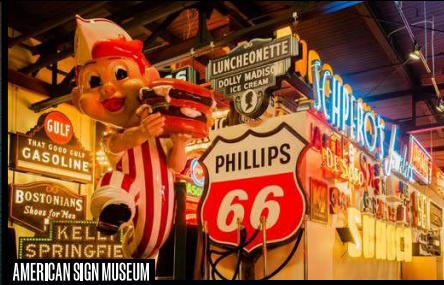
AMERICAN SIGN MUSEUM