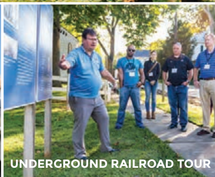
UNDERGROUND RAILROAD TOUR