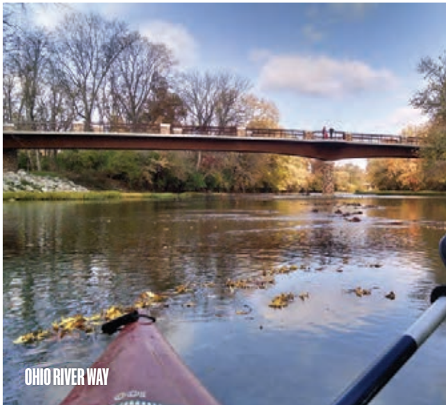
OHIO RIVER WAY