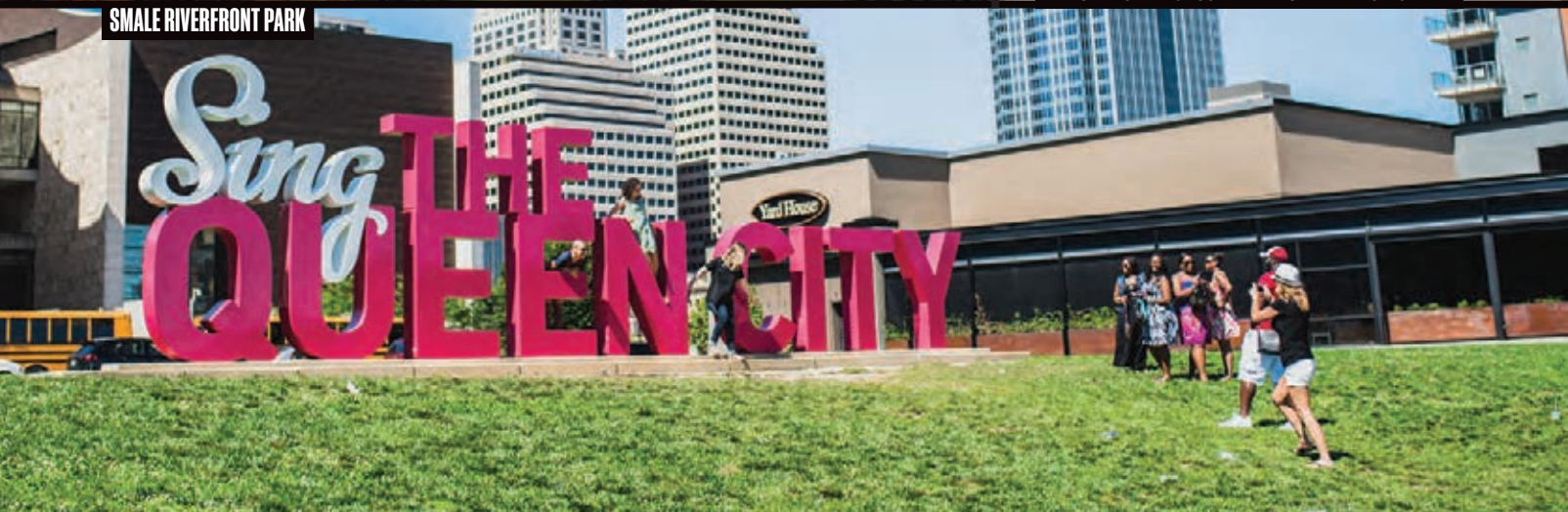
SMALE RIVERFRONT PARK