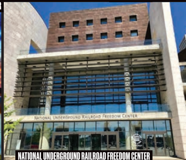
NATIONAL UNDERGROUND RAILROAD FREEDOM CENTER