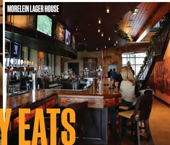
MORELEIN LAGER HOUSE