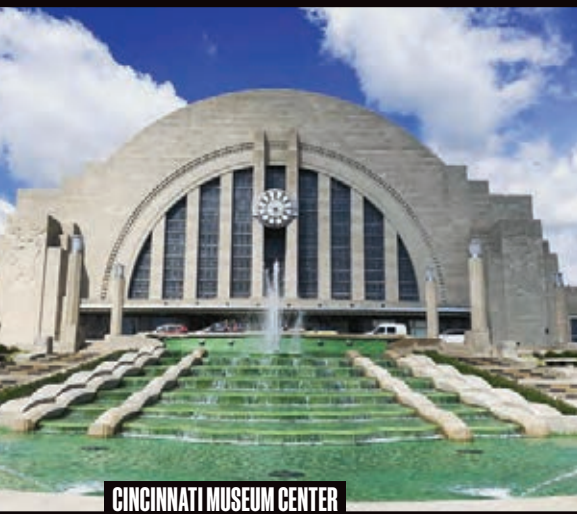
CINCINNATI MUSEUM CENTER