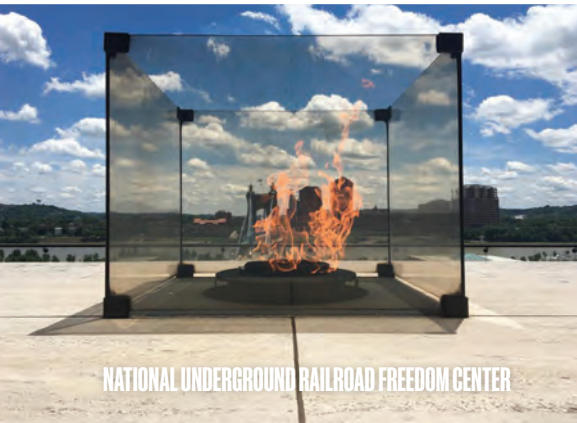
NATIONAL UNDERGROUND RAILROAD FREEDOM CENTER

As the place where the North ends and the South begins, the Cincy Region offers a unique perspective of American history. The National Underground Railroad Freedom Center is a must-see and is dedicated to telling the true story of the Underground Railroad and the impact it had in this region. The Harriet Beecher Stowe Home is another wonderful addition to any itinerary that showcases this celebrated author's literary contributions to society and notable abolitionist works, including the novel "Uncle Tom's Cabin," which was hugely impactful on American culture leading up to the Civil War. Or take a walking tour over the famous John A. Roebling Suspension Bridge or a Newport Gangster Tour to see Newport, America's original "Sin City."