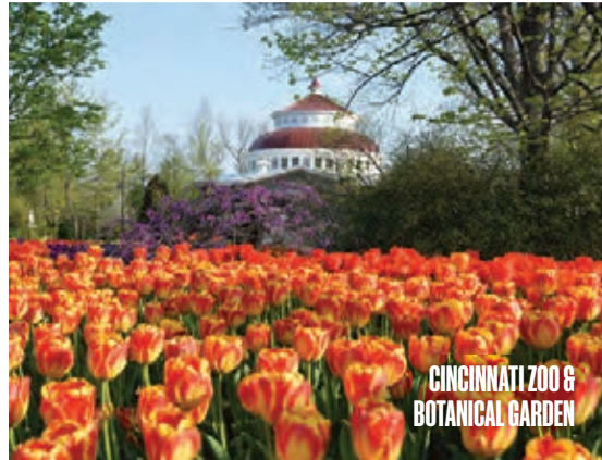
CINCINNATI ZOO & BOTANICAL GARDEN