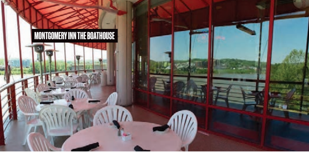
MONTGOMERY INN THE BOATHOUSE