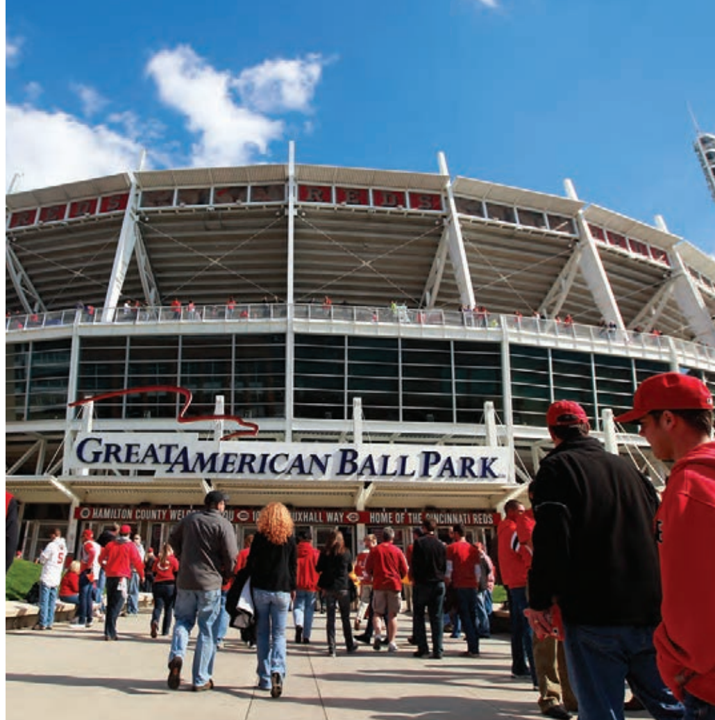
GREAT AMERICAN BALL PARK

Ring in the sweet sounds of springtime, as Cincinnati annually hosts the oldest continuous choral festival in the Western Hemisphere. Join the May Festival Chorus and the Cincinnati Symphony Orchestra for two weekends of choral music and orchestration at Music Hall.