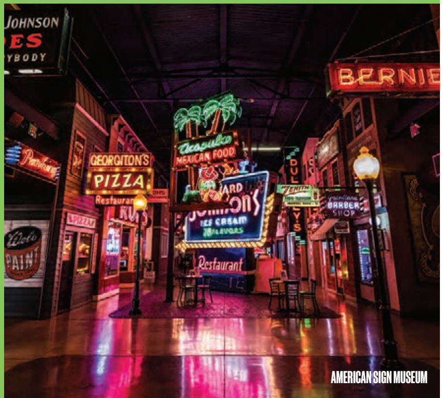
AMERICAN SIGN MUSEUM