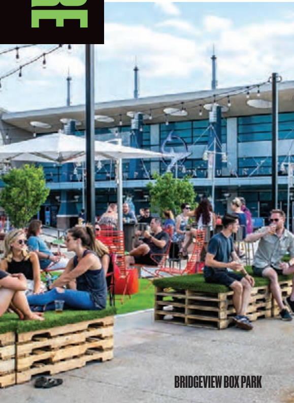
BRIDGEVIEW BOX PARK

beautifully maintained golf courses or at Topgolf West Chester , a state-of-the-art virtual golf simulator and sports bar and restaurant.