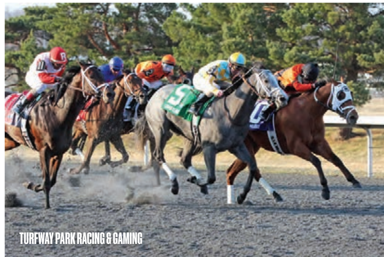
TURFWAY PARK RACING & GAMING

There is nothing like game day in the Cincy Region! Join the roar of the crowds rooting for our football team, the Cincinnati Bengals, or America's first baseball team, the Cincinnati Reds. Be sure to visit the Cincinnati Reds Hall of Fame & Museum , which showcases our groundbreaking baseball history. New to the sports arena is FC Cincinnati, our Major League Soccer team that debuted in 2019. For racing fans, our region is home to many notable horse tracks, including the new Turfway Park Racing & Gaming by Churchill Downs in Florence.