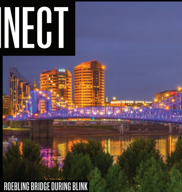
ROEBLING BRIDGE DURING BLINK