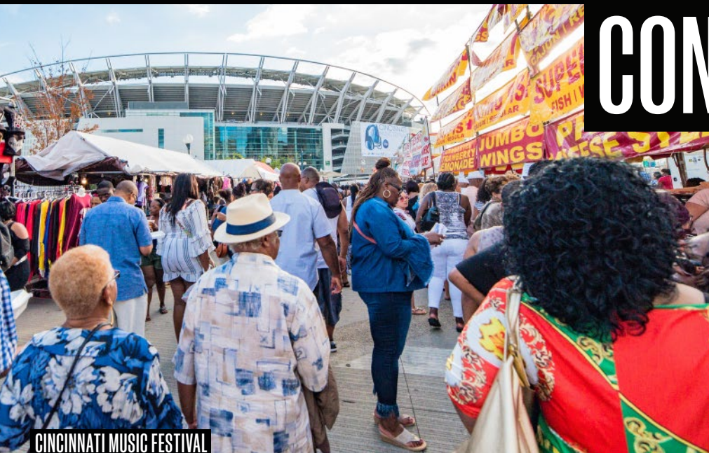
CINCINNATI MUSIC FESTIVAL