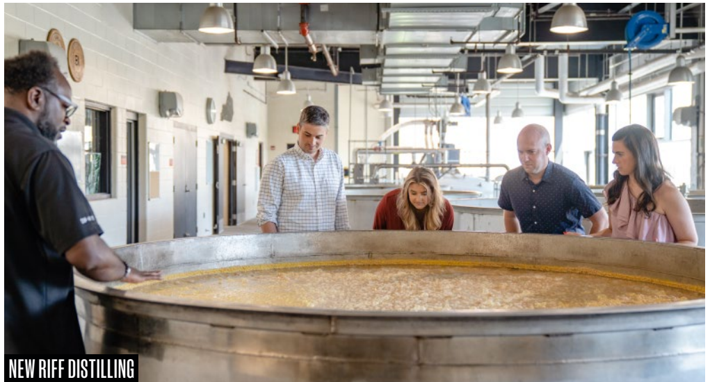
NEW RIFF DISTILLING