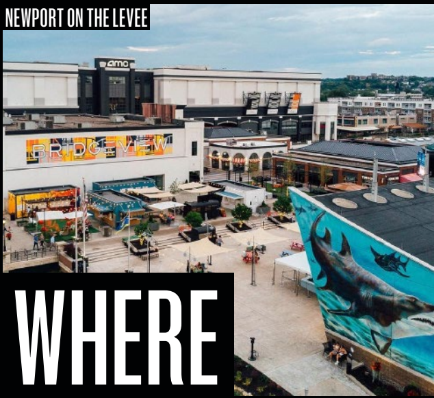
NEWPORT ON THE LEVEE