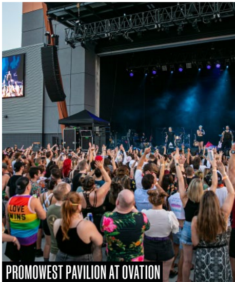
PROMOWEST PAVILION AT OVATION