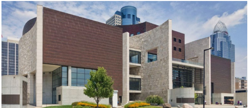
NATIONAL UNDERGROUND FREEDOM CENTER

Cincy brings to life a plethora of “only in America experiences” like a walk-through American History as told by signs at the American Sign Museum. Cincy also is home to the inspiring National Underground Freedom Center, a space that preserves the story of an enslaved people’s journey to freedom in the North and upholds a promise to continue the fight against slavery into the present. Cincy features attractions of biblical proportions including the Ark Encounter, a true to bible scale of Noah’s Ark and the largest timber frame structure in the world.