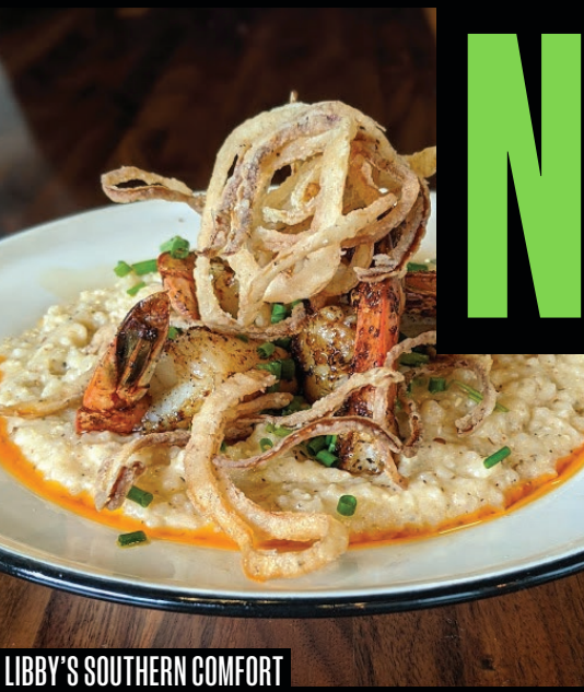
LIBBY'S SOUTHERN COMFORT