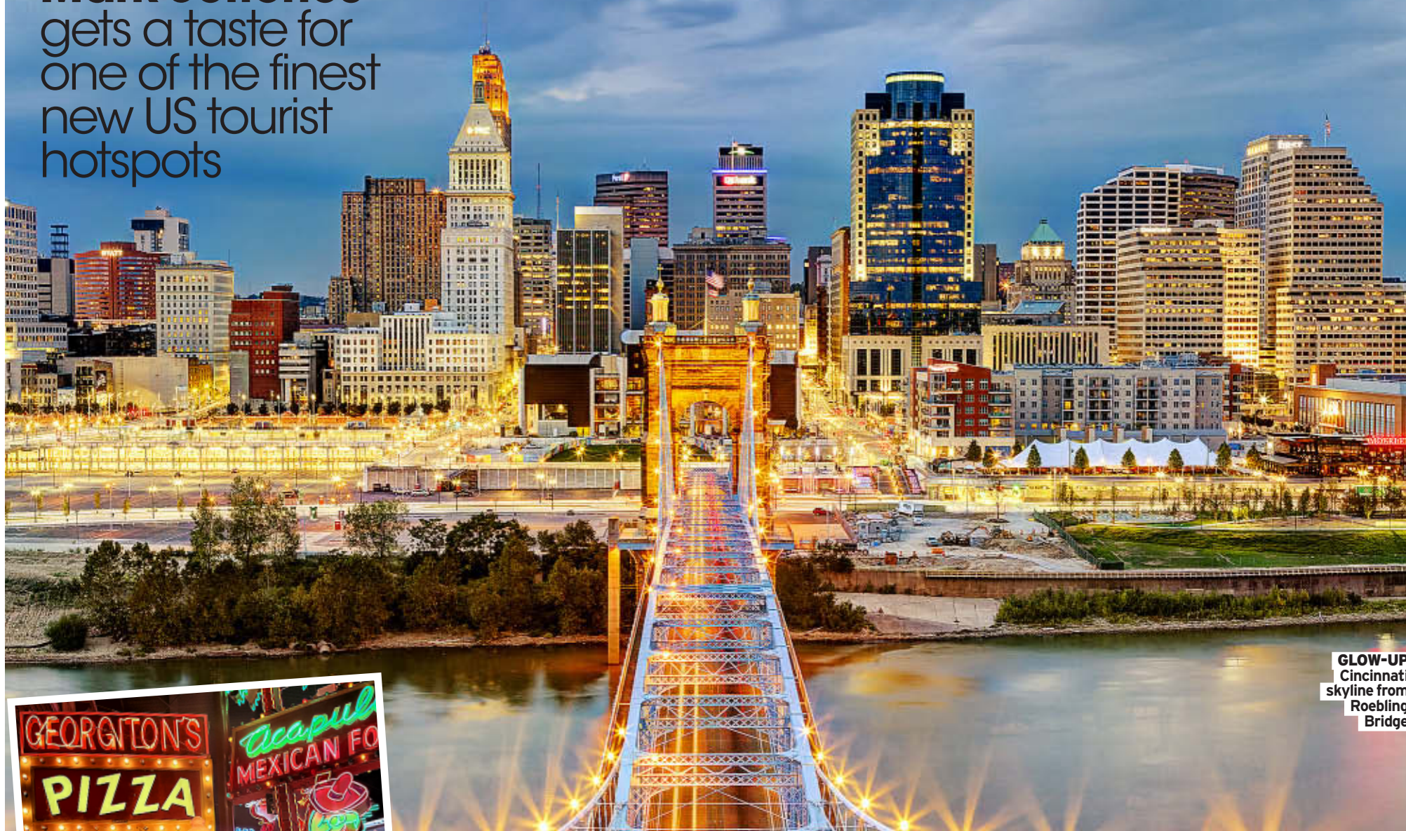
GLOW-UP Cincinnati skyline from Roebling Bridge