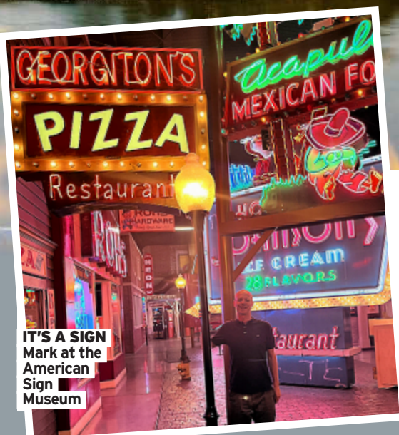
IT'S A SIGN Mark at the American Sign Museum

T he local chilli may be on the mild side – but Cincinnati is heating up as a holiday destination.