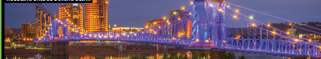
ROEBLING BRIDGE DURING BLINK