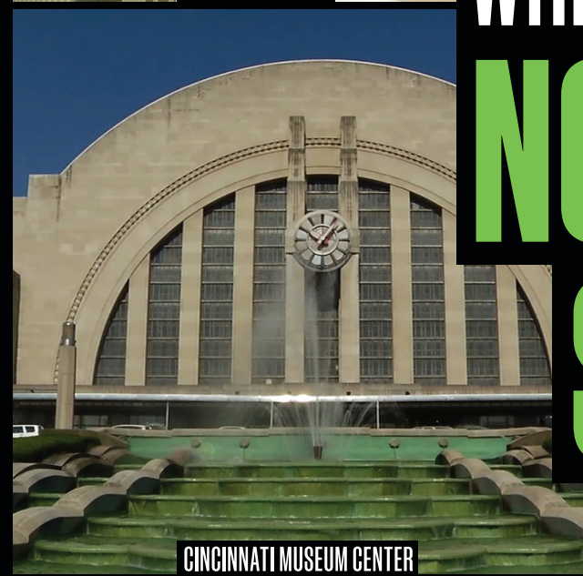
CINCINNATI MUSEUM CENTER